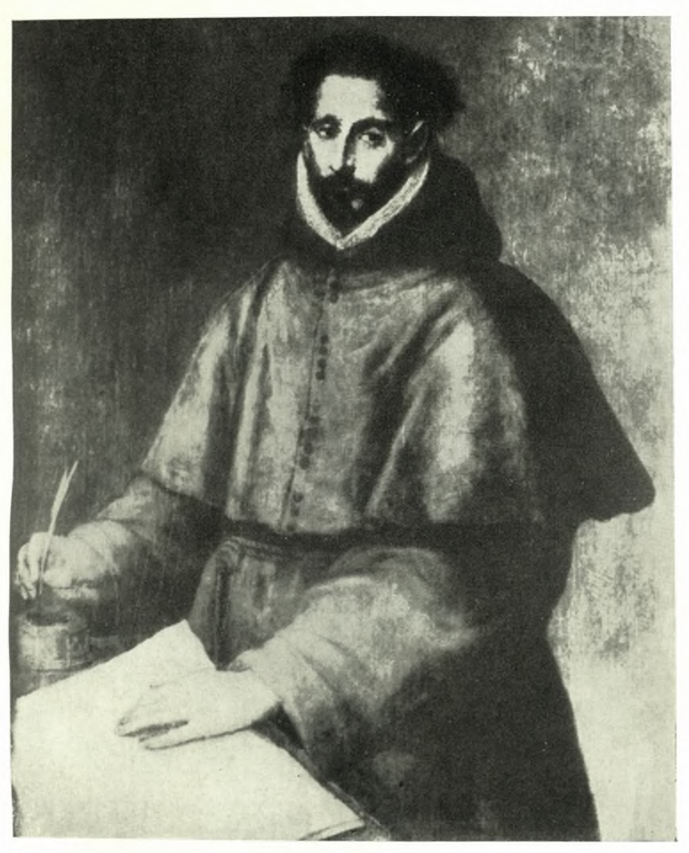
Δ. Θεοτυχόπουλος: Προσωπογραφία Καρδιναλίου. Πρώην Συλλογή Πιντάλ, Μαδρίτη.