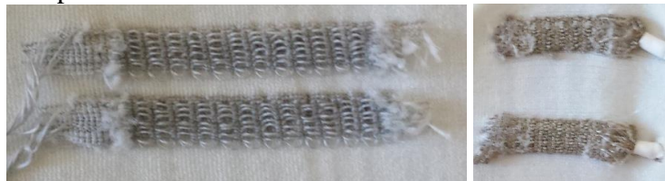
Figure 1. Textile electrodes produced for EMG using two specially design structures which result in an increase on thickness of at least about 100% when compared with the thickness of the surrounding fabric.

The structure used for the production of the textile electrode can play a decisive role regarding its performance. Flat knitted structures, such as jersey, present an important advantage which is uniformity. This is an important characteristic in the standard electrodes, where one can find a homogenous layer of a particular material, such as silver. These structures behave very well when in constant contact with the skin. However, even with compression this contact may not be permanent and for this reason padding stands out to be a good aid. The experience of this research team during the past years suggest to use specific structures in which a 3D effect can promote a more permanent contact with skin. The specific design of these structures should allow the area where the conductive yarn is placed to rise from the plane usually considered on textile fabrics. These structures are the result of the combination of the three fundamental knit loops. For this particular case, the team selected the combination of normal and floating loops. The following pictures present different examples, where can be observed the effect of rising the structure into the third dimension, thus increasing the thickness. This will improve and maintain the contact between the electrode and the skin.