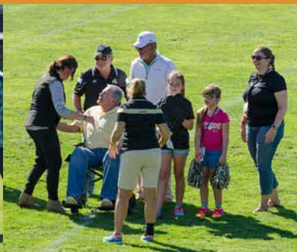
Members of championship teams from reunion class years were recognized on the field at halftime.