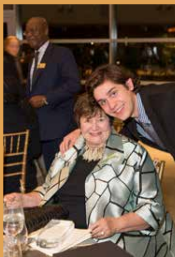
The Champions for Philanthropy awards dinner, which takes place every Reunion @ Homecoming weekend, recognizes our most generous donors. See story on p. 9 for more information.