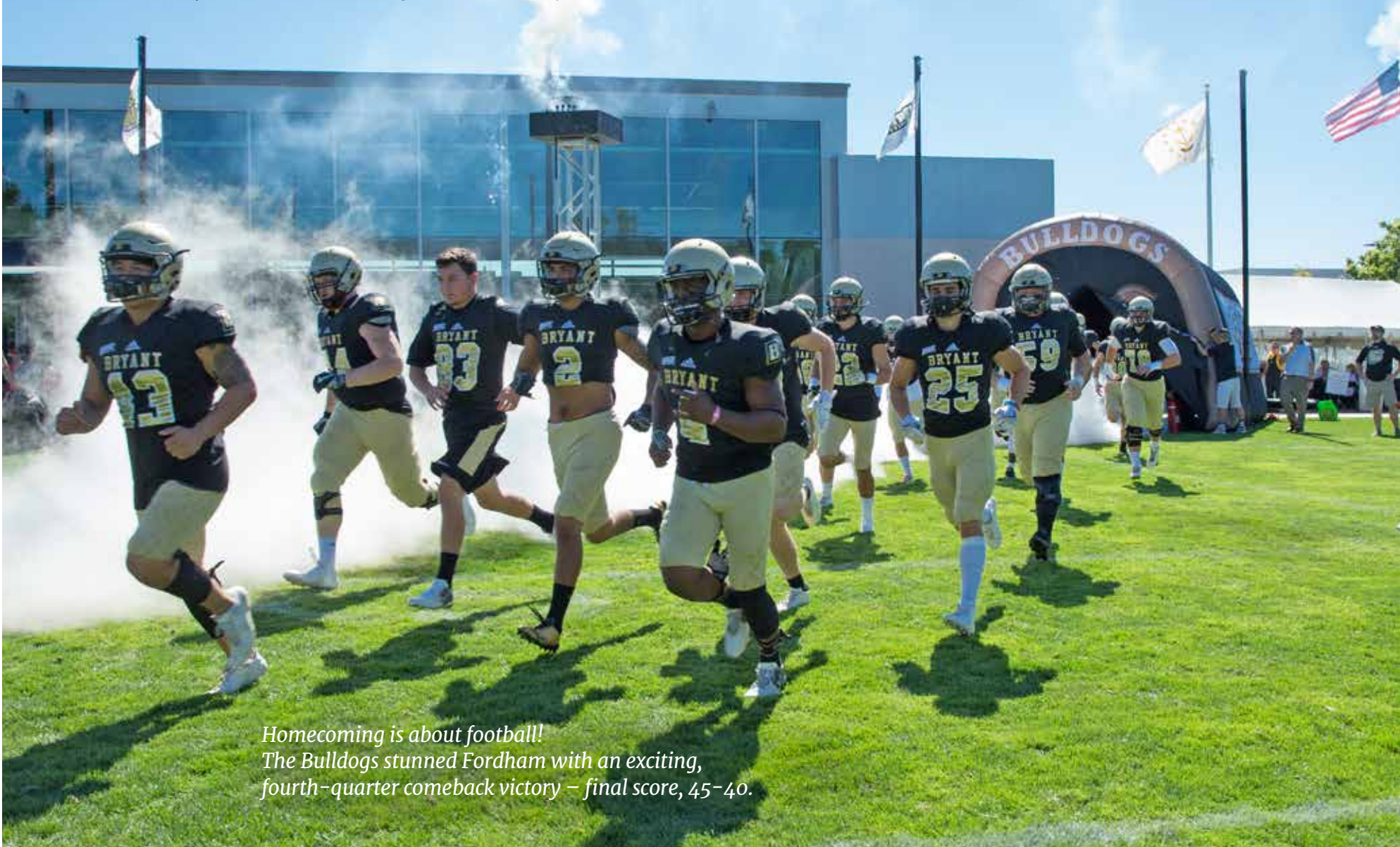
Homecoming is about football! The Bulldogs stunned Fordham with an exciting, fourth-quarter comeback victory – final score, 45-40.

View more photos on Facebook @ facebook.com/bryantalumni