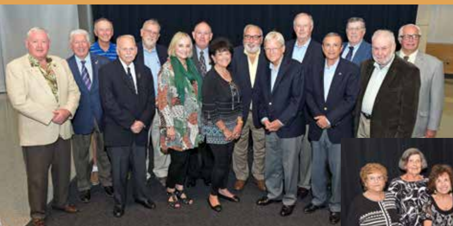
The Class of 1967 joins the Archway Society (formerly the Loyal Guard) – those who graduated 50 or more years ago.