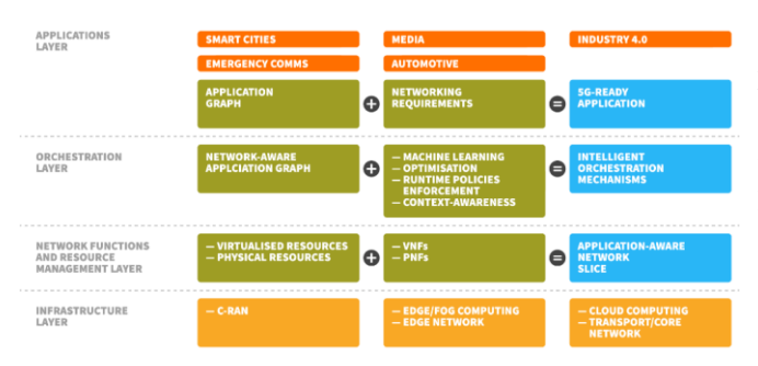
Figure 1. MATILDA 5G High Level Architectural Approach.

The Applications layer corresponds to the Business Service and Business Function layer and regards the design and development of the 5G-ready applications per industry vertical along with the specification of the associated networking requirements. The Orchestration Layer regards the support of deployment and optimisation mechanisms of the 5G-ready applications over the available multi-site programmable infrastructure. Orchestration refers to both the application components and the attached virtual network functions and includes a set of intelligent mechanisms for optimal deployment, runtime policies enforcement, data mining and analysis and context awareness support. The Network Functions and Resource Management Laver regards the implementation the of resource management functionalities the available programmable over infrastructure, as well as the lifecycle management of the activated virtual network functions. The Infrastructure Layer consists of the data communication network spanning a set of cloud computing and storage resources.