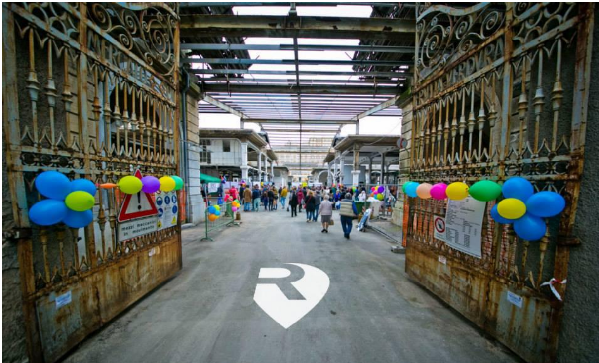
Figure 2. The quality label is used in recycled spaces as a mark of reliability, transparency, acknowledgement.

The main difficulty, emerging from our analysis and activities with the municipality, is the regularisation of spontaneous processes and DIY practices. Another weakness relates to the impact of the projects developed without public regulations. Municipalities have often no specific rules and instruments to legalise this kind of activities, so they tend to force spontaneous processes into official methods and procedures. At the same time creative activists and citizens' associations lack in management skills.