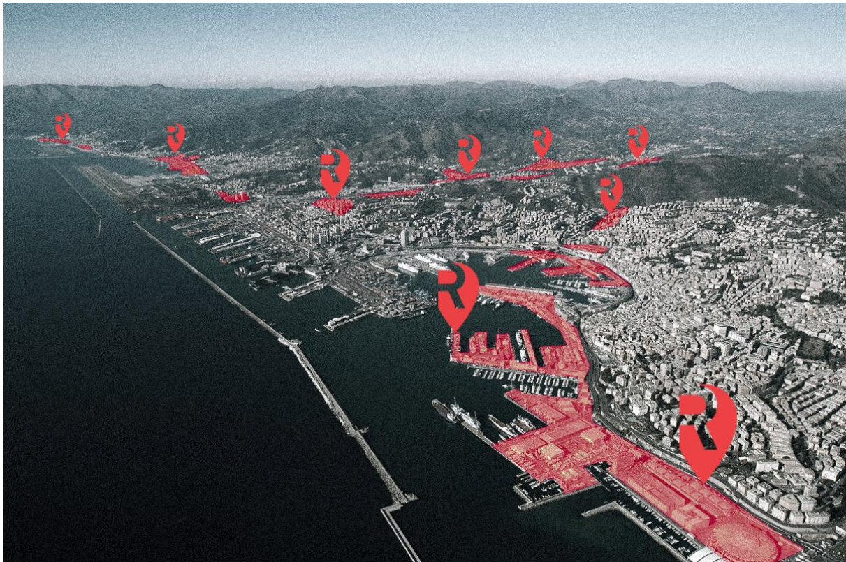
Figure 3. Having and sharing awareness of activists is one of the main objectives of Reagente.

Design contributes in creating a brand/quality label to strengthen these different bottom-up initiatives, transforming them in public-interest services from an environmental and social point of view.