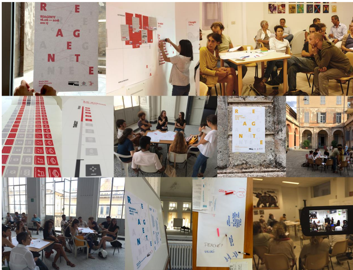
Figure 4. Meetings of Reagente in different locations of the city.

Starting from active citizens Reagente has become a process carried out through three events in summer 2016 with the collaboration of the Local Administration. It is addressed to active citizens, association and individuals with the aim of creating a label to be joined through a collective process, to develop connections, share specific values and, at the end, give visibility and spread reuse actions beyond the project.