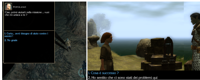
Fig. 2. The same activity (dialogue) differently developed for the two game levels