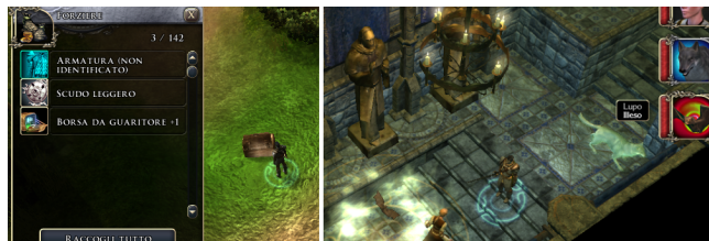
Fig. 3. Activities in the flow game level: “chest opened” and “group fight” with allies

tiveness with poor gratification, minimal plot-story, weak visual assets, plain dialogues (Fig. 2) and unnecessary allies.