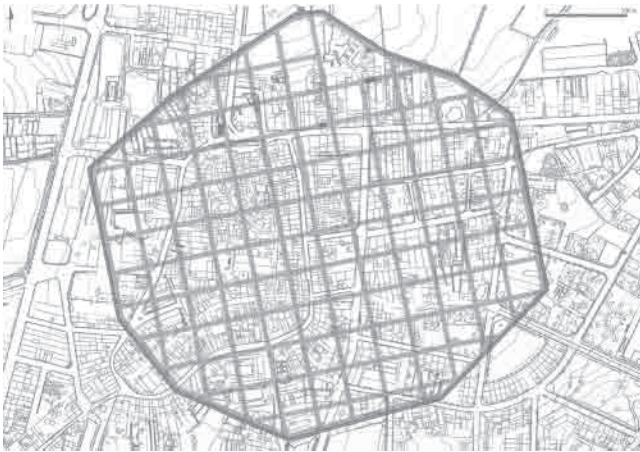
Figure 6. Iesso (Guissona): Interpretative scheme of the wall and the urban layout of the city drawn up from the information available on its archaeological topography, and superimposed on the layout of the town of Guissona today.

hypothesis about the general features of its urban layout. The northern boundary of the urban perimeter has been established with confidence thanks to the fact that part of the wall was uncovered through the excavation. For the western and southern boundaries, an analysis of aerial photographs and plot maps combined with the information provided by the archaeological remains documented have enabled us to sketch a proposed layout, as it seems