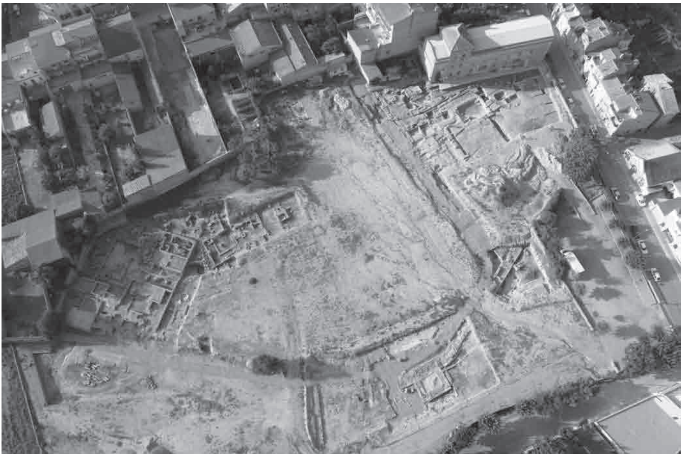
Figure 7. Overall view of the Archaeology Park of Guissona in the process of excavation, with the remains of the north wall, the public baths and numerous houses and streets from the Roman city of Iesso (Guissona).

By combining this information with the possible perimeter, a hypothetical general schema was proposed that