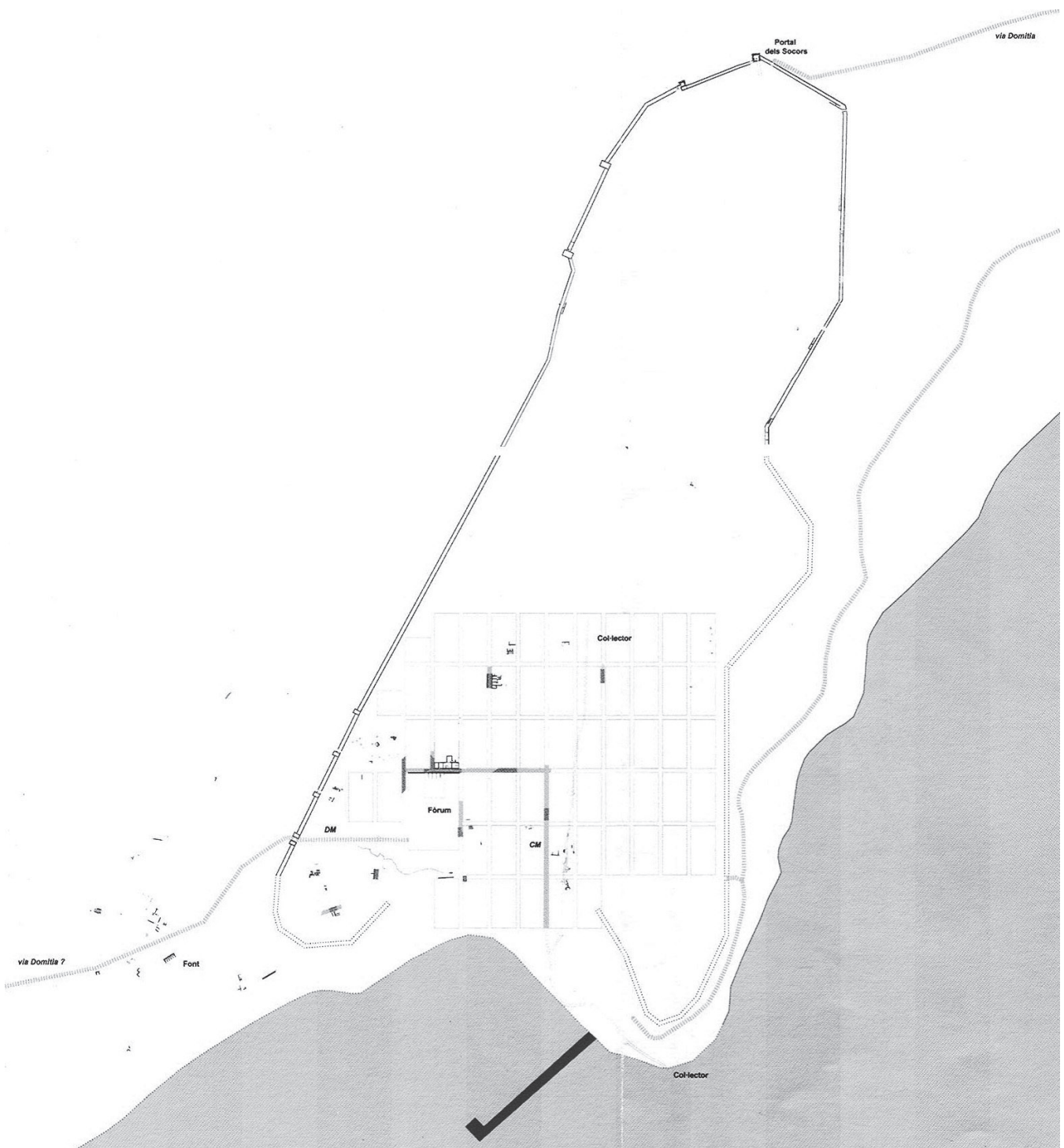
Figure 11. Tarraco (Tarragona): Layout with remains from the Late Republican period with an interpretation of the urban layout of the southern part of the walled premises (from Macias et al. , Planimetria... op. cit. p. 27).

this scheme was only conducted on the southern part of the walled premises, south of today's Rambla Nova, is quite provocative. In the area located between Rambla Nova and the upper part, a regular urban planning model would not have been applied until a later date, perhaps in the second half of the 1st century BC. However, this does not mean that before then it was a construction-free zone, as archaeology has documented Late Republican structures that seem to predate the urban remodelling of this