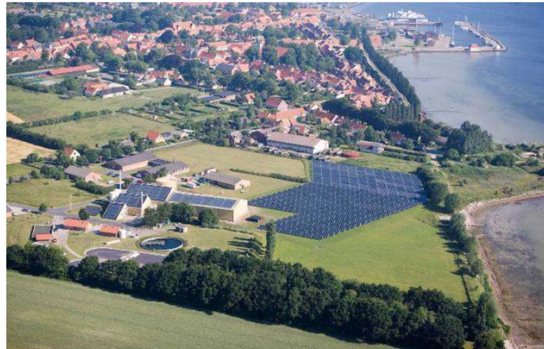
Solar district heating plant