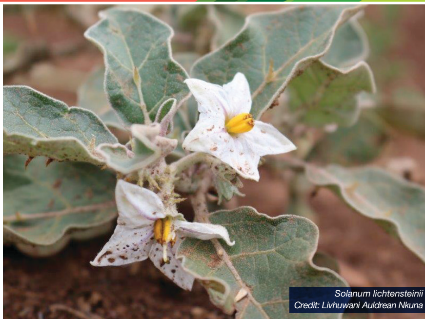
Solanum lichtensteinii

CWR can be found in all types of habitats. They are often vulnerable and require urgent conservation, but are not commonly included in national conservation programmes. The ACP-EU supported SADC CWR Project, implemented in Mauritius, South Africa and Zambia, aims to enhance the in situ conservation of CWR by developing capacity in the SADC region to conserve and sustainably utilize CWR for climate change adaptation and to persuade governments to endorse national strategies and implement an action plan for the effective conservation of CWR.