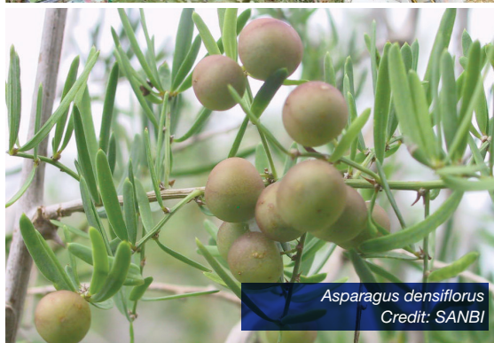
Asparagus densiflorus