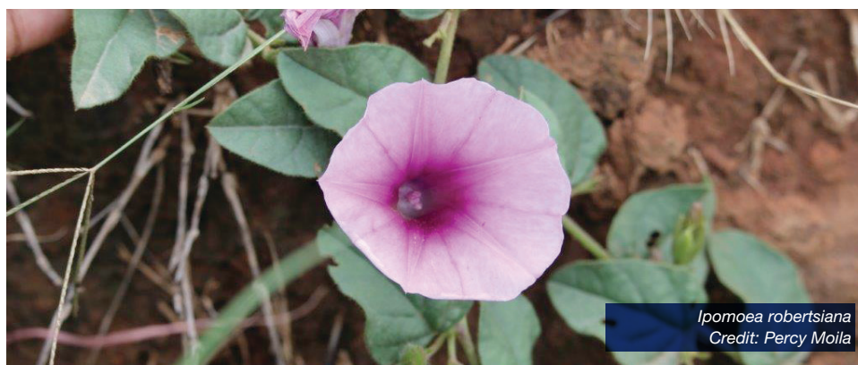
Ipomoea robertsiana

A representative each from DAFF, South African Plant Breeders' Association and Southern African Confederation of Agricultural Unions (SACAU) were members of the project Steering Committee to review and monitor progress and activities.