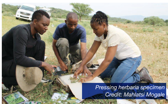
Pressing herbaria specimen

Through the project, South Africa developed a food and fodder CWR checklist of 1593 species. Looking at their potential for crop improvement, the socio-economic value of the crops concerned, their geographic distribution and their conservation status, 258 of the 1593 were categorised as priority CWR (see Figure 1). Of the priority CWR, 70 are of conservation concern.