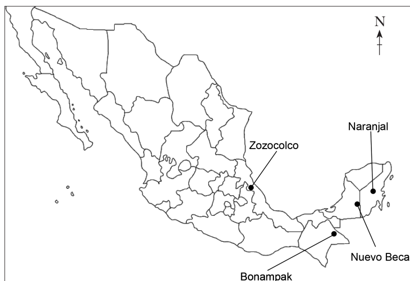
Figure 1 Location of the four populations of Swietenia macrophylla sampled in the states of Campeche (Nuevo Becal), Chiapas (Bonampak), Quintana Roo (Naranjal) and Veracruz (Zozocolco), Mexico

In Campeche, trees were sampled 13 km north-east of Nuevo Becal, a zone containing medium-height semi-evergreen tropical forest in the municipality of Calakmul (Martínez & Galindo-Leal 2002). In Quintana Roo, trees were sampled in Naranjal Poniente (hereafter Naranjal), a town located to the west of Felipe Carrillo Puerto. The trees were sampled in a zone set aside as a local reserve for seed collection, also within a medium-height semi-evergreen tropical forest. In this stand, normal diameter (1.3 m) of mahogany trees exceeds the minimum cutting diameter of 55 cm. In Chiapas, trees were sampled within the influence zone of the Montes Azules Biosphere Reserve at 1 km south-east of the Lacandon community of Bonampak, near the archaeological monuments of Bonampak. The vegetation is characterised as tropical rain forest (Meave del Castillo 1990). In this area, some individuals with normal diameter of > 70 cm could be found. The fourth population was located in Zozocolco (44 km south-east of