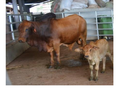
New breed-types (genome editing)