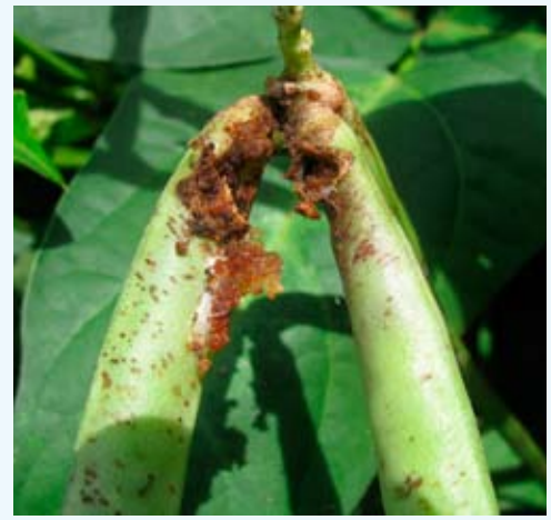
Cowpea pods damaged by the legume pod borer, Maruca vitrata. – D. Coyne, IITA

Kenya, Lao PDR, Taiwan, Thailand, and Vietnam for population characterization. The insects are being characterized, based on the partial gene sequences of the cytochrome oxidase I. The adult samples are also being collected for characterization based on the morphological keys. Two parasitoids (one each from Taiwan and Thailand) have already been collected and sent for identification. Collaborators in Laos, Thailand, and Vietnam are currently searching for more species-specific parasitoids. Collaborators at icipe have collections of pheromone compounds from female moths in Kenya and are expecting samples from Bénin and either Taiwan or Thailand. Collaborators at Humboldt University Berlin (HUB) have collections from Taiwan and Bénin; they are