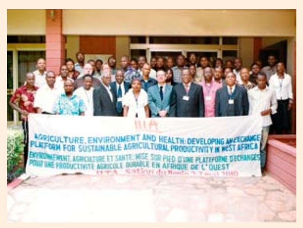
Launch of the Agro-Eco-Health Platform in Bénin.

molecular techniques used for investigating insecticide resistance in insects, and the effect of pesticides residues on non-target organisms, such as mosquito populations (malaria vectors) which breed in and around farms with a high use of synthetic pesticides. Trainings have also been conducted on the analysis of the chronic toxicity of pesticide residues found in water and soil samples and their implications for human health. As an alternative to synthetic pesticides, plant based insecticides are screened for their effects on both agricultural and medical pests.