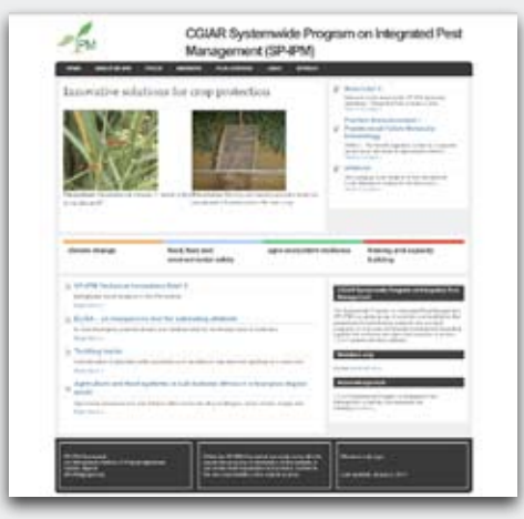
The new SP-IPM website went live end of 2009. www.spipm.cgiar.org

Beginning in 2010, a quarterly e-newsletter was launched, targeting SP-IPM members and partners, investors, and interested individuals and organizations. This newsletter features activities of the Secretariat and achievements of SP-IPM members; provides information about events and new and finalized projects; and allows members to introduce themselves and their work.