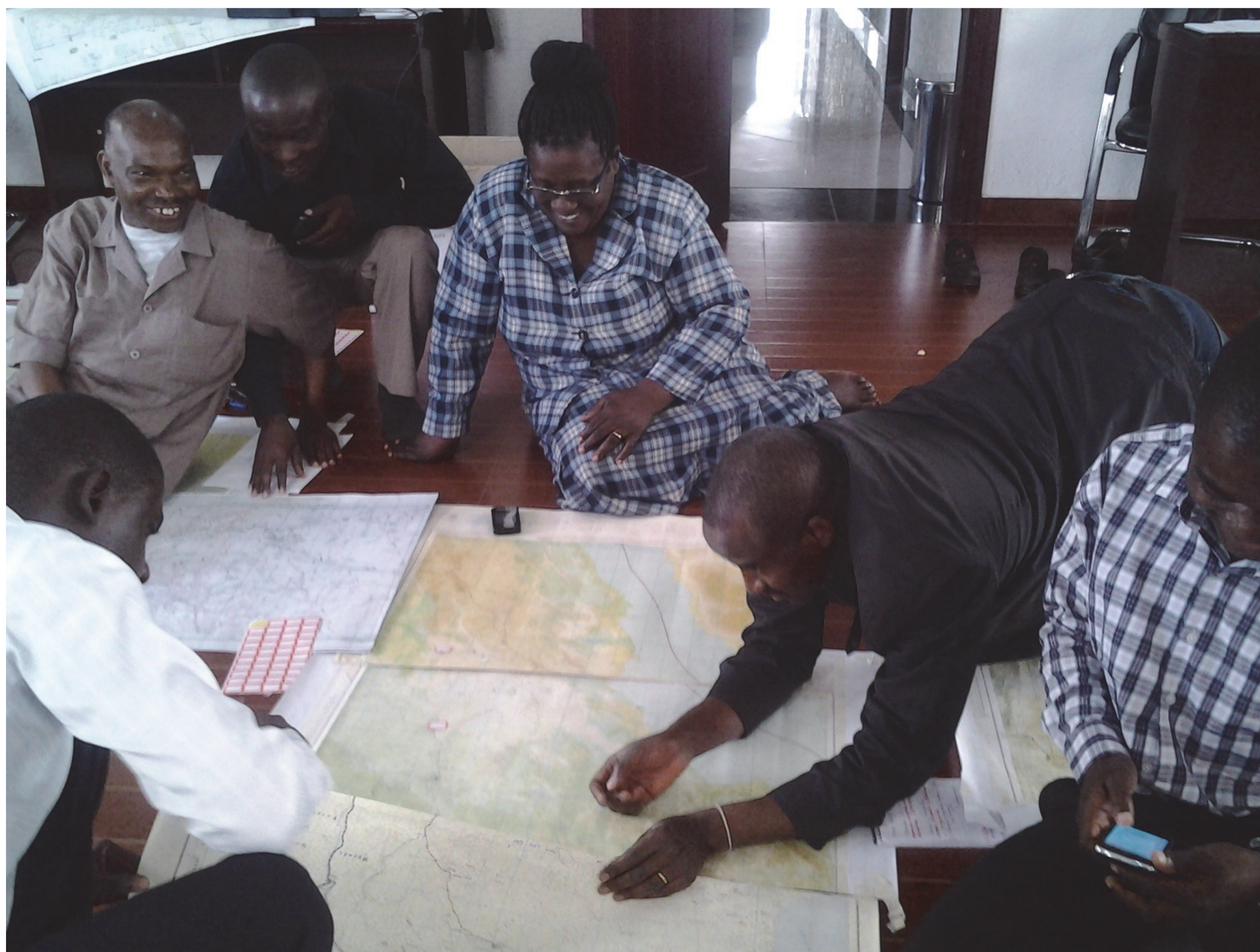
The mapping of livestock routes at national level and related awareness-raising is contributing to a more enabling environment for protecting pastoralism as a way of life, (ILRI/Fiona Flintan).

Working closely with national and local governments, SRMP aims to influence policy and legislation to provide a more enabling environment for securing the rights of local rangeland users, including rights to key resources such as access to grazing areas and water, while maintaining necessary mobility. The project also aims to improve the participation of such users, women and men, young and old, in decision-making processes pertaining to their lands.