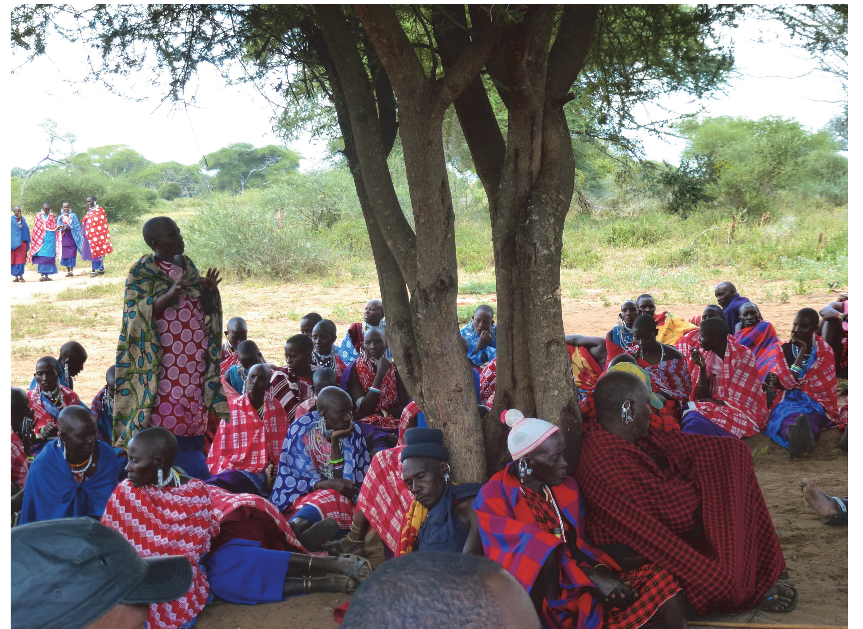
Opening up spaces for women to contribute to decision-making process in village land use planning is an important responsibility of SRMP.