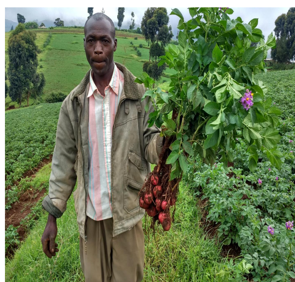
Plate 1: Premature harvesting at 70 DAP