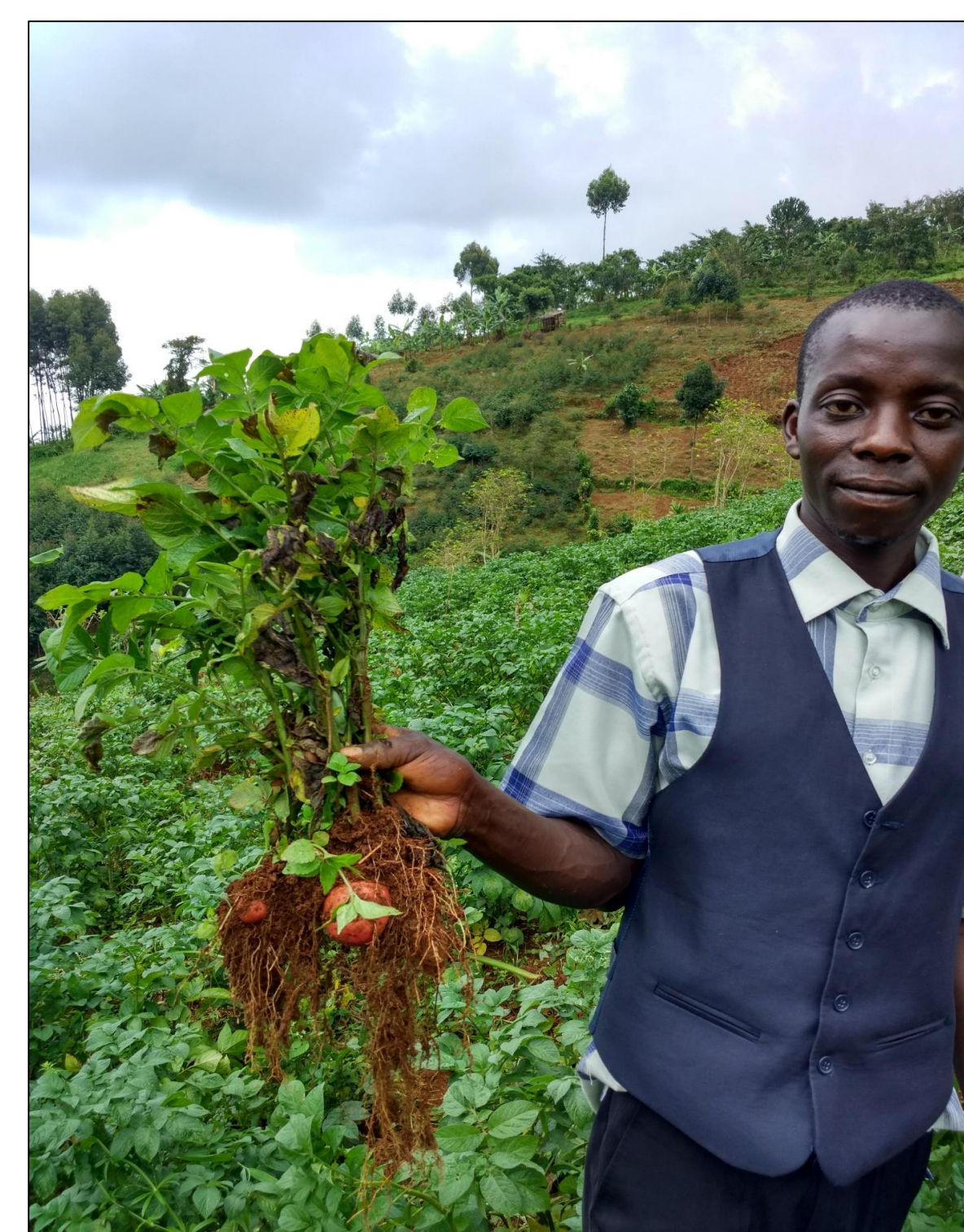
Plate 2: Late blight influences decision to pre-harvest