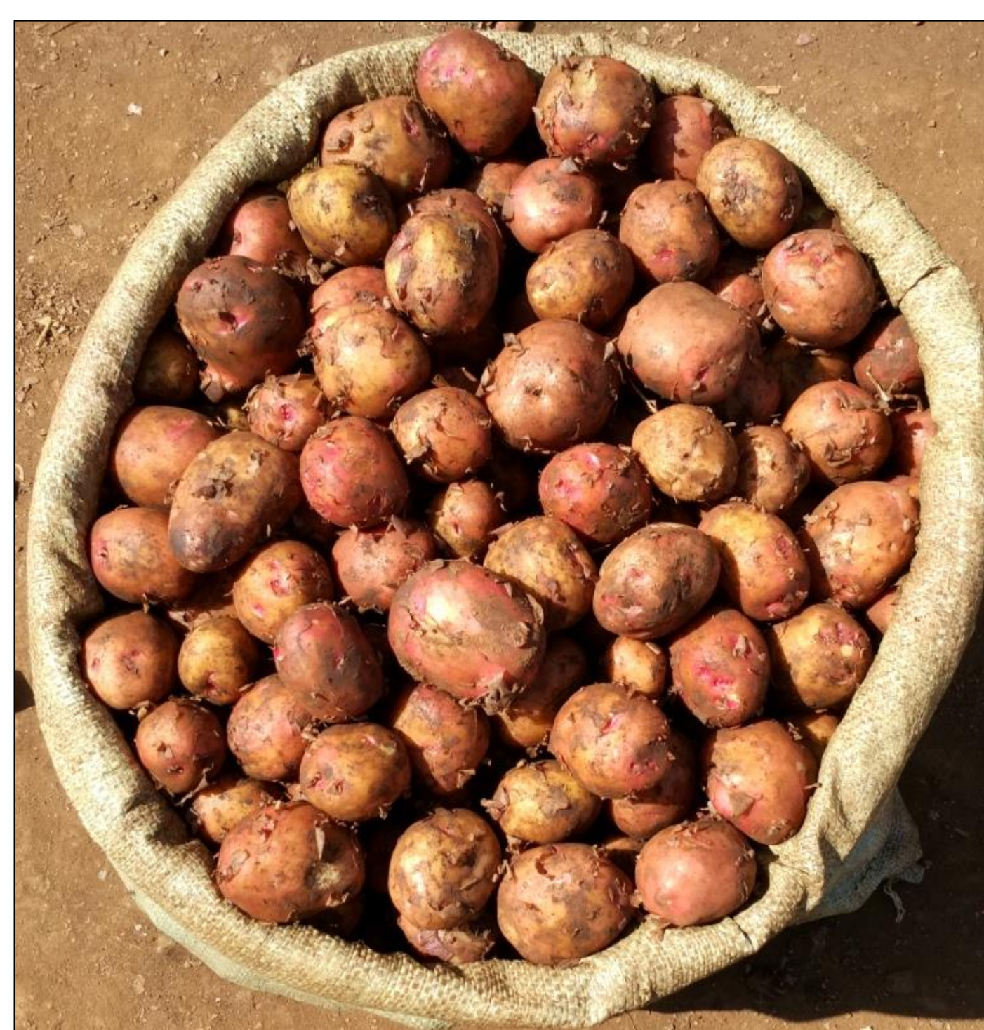
Plate 3: Premature thin-skinned tubers on the market