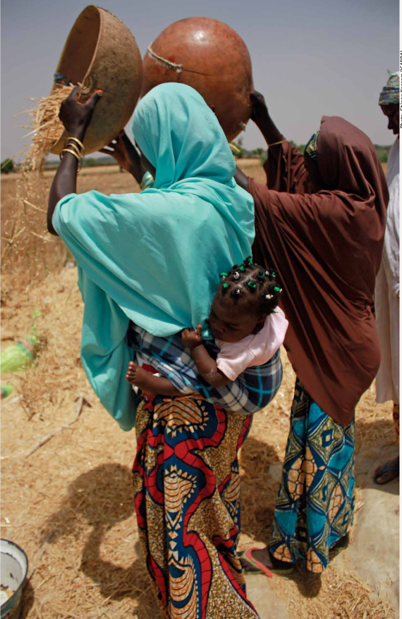
Nigerien women winnowing wheat