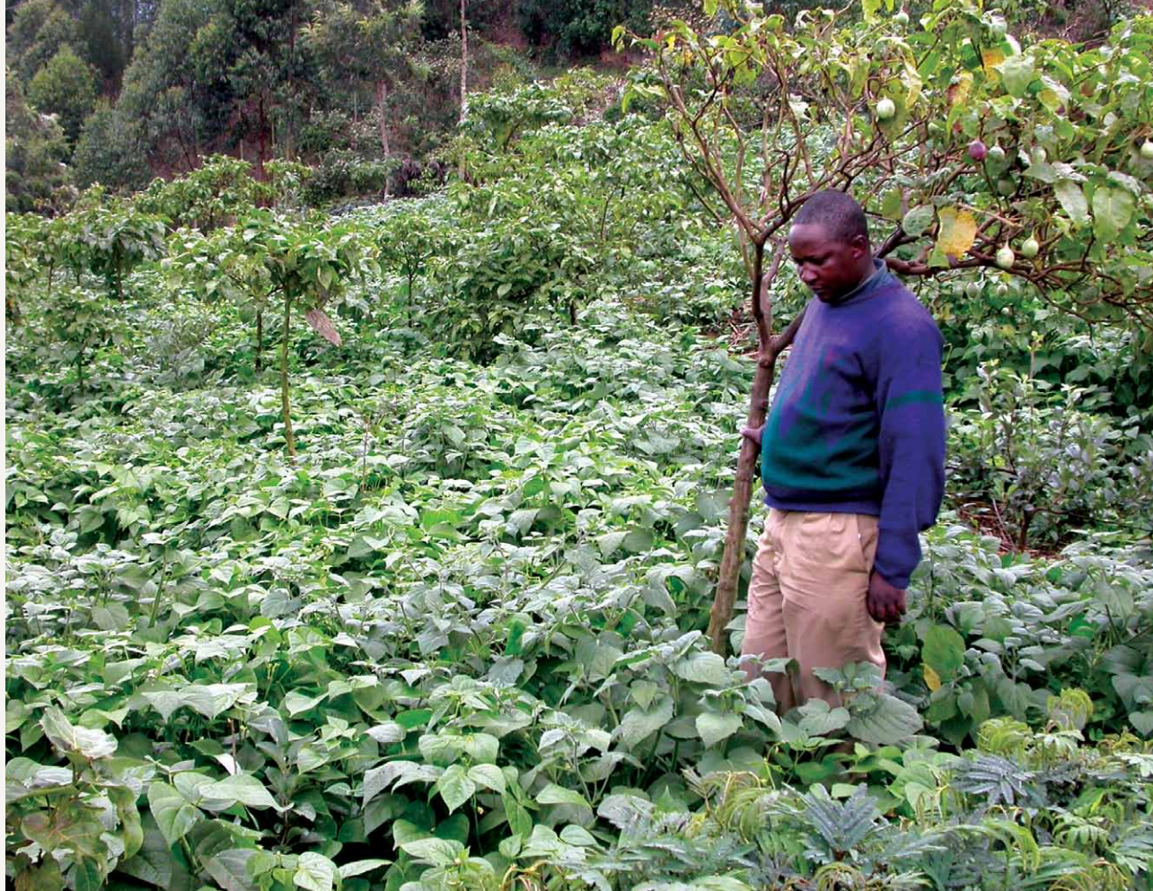
Bean field in Central Africa

Even with these tools, however, practitioners and researchers attempting to conduct a systems analysis need to wrestle with a number of questions, including: which systems should be analysed? Where should the boundaries of these systems be set? Which components, levels or actor-networks should be included in the analysis? And which tools are most suitable? The answer to these questions depend on a number of factors, including: