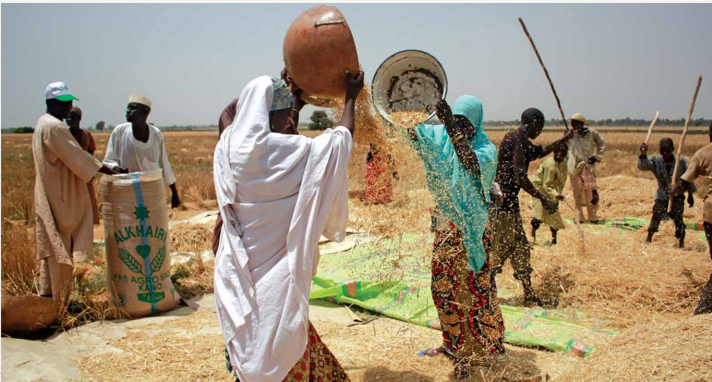
Wheat harvest in Nigeria