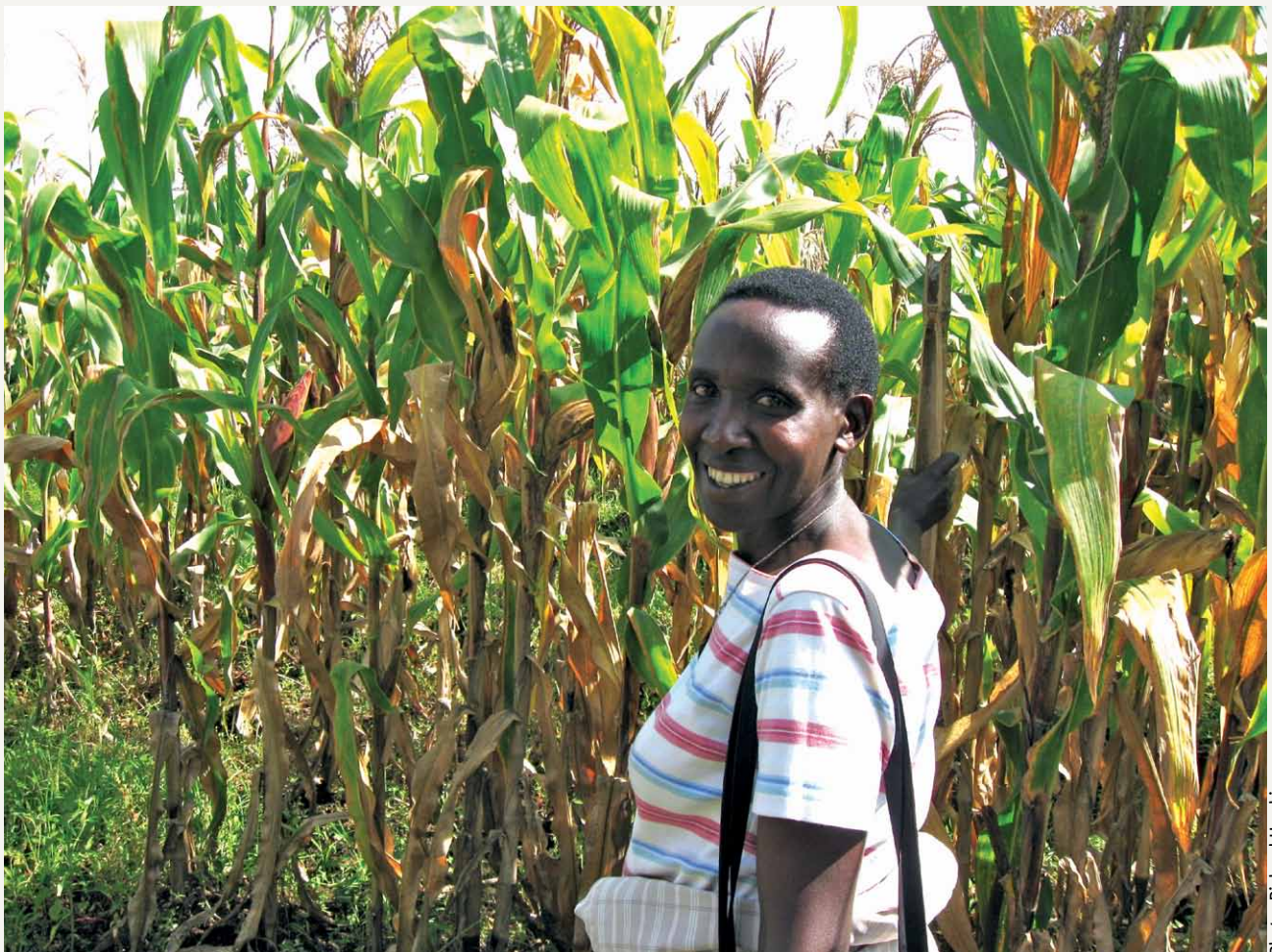
Maize crop in Central Africa