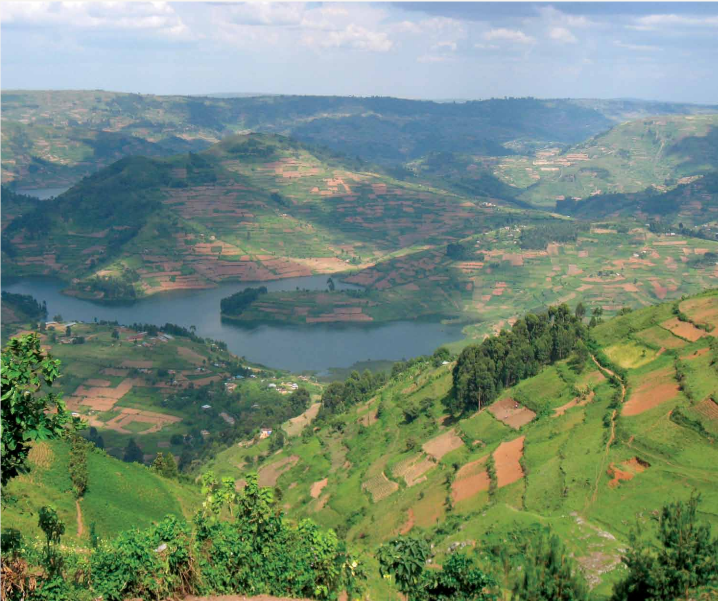
Landscape of Central Africa

analysis, a number of productivity, natural resource management, and policy/market constraints were prioritised, which provided the basis for the development of intervention plans. Examples included, testing different potato varieties in northern Rwanda, experiments with fodder options in Burundi, and maize-soybean intercropping in Democratic Republic of the Congo. The systems analysis enabled the stakeholders to think about trade-offs and synergies at farm level. For instance, planting fodder crops on the hilly slopes of central Burundi and northern Rwanda provided fodder for animals, but also contributed to better erosion control, water harvesting and the reduction of soil degradation. Another example is the intercropping of maize and (grain) legumes: legumes fix nitrogen in the soil, while at the same time functioning as a cover crop (reducing weeding and enhancing the water retaining capacity of the soil), and providing an important source of protein for human and animal diets.