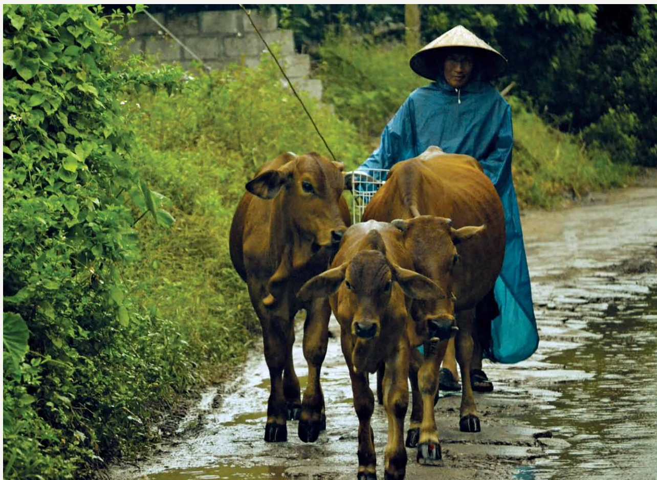
Walking cattle, Vietnam

In this case, a new analysis framework was applied to quantify a simple food security indicator, specifically developed to analyse the livelihoods of smallholder farmers and to assess the potential impacts of proposed intervention options (Frelat et al., 2016). The analysis used data from the ImpactLITE farm household survey executed in 2014 (see http://bit.ly/znAvmoj for a detailed description). Members of 400 households in the Central Highlands in Central Vietnam were interviewed during a survey. Information on household composition, farm practices, the production, sales and consumption of agricultural produce and off-farm income was collected for each household.