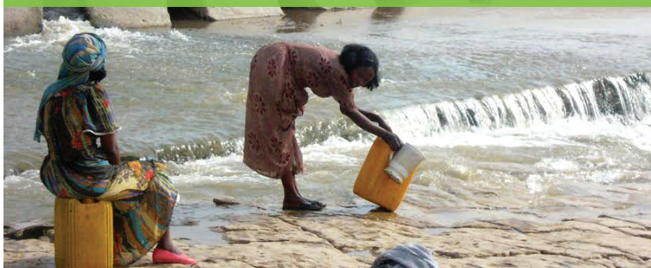
FIGURE 4. WOMEN COLLECTING WATER. TO HAVE A GREATER IMPACT, WATERSHED MANAGEMENT PROJECTS SHOULD BE GENDER SENSITIVE.