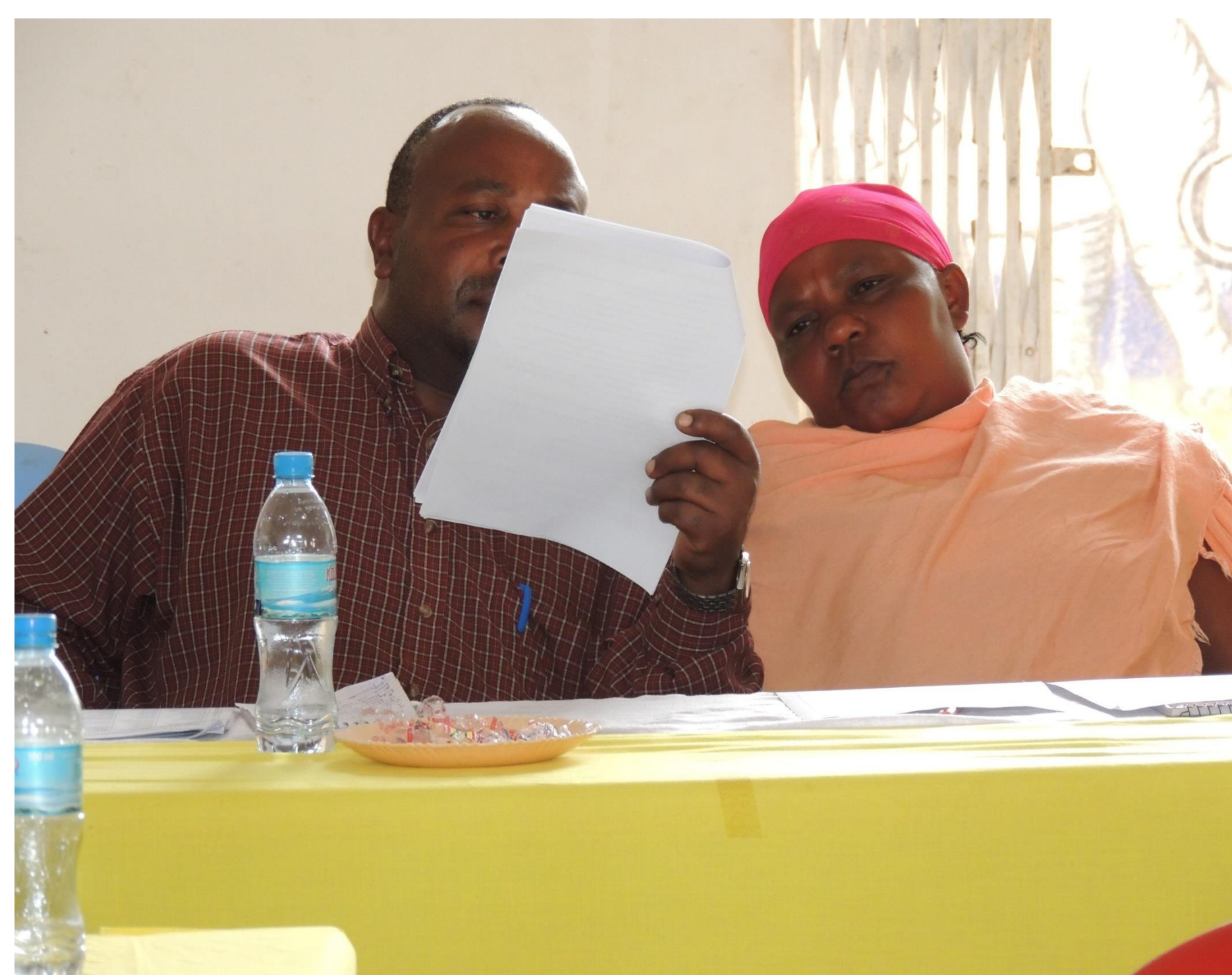
Figure 3. Participants thoroughly reading a copy of JUMBA constitution before approving it at JUMBA General Meeting held on 17/11/2016 in Babati.

Developed a constitution (Figure 2 & 3), and identified priority areas for immediate action, namely (i) training farmers TOT, extension agents and youth on improved agronomic packages, farming as business, marketing skills groups dynamics/management (ii) establishment of platform at ward level (iii) linking farmers to credit facilities