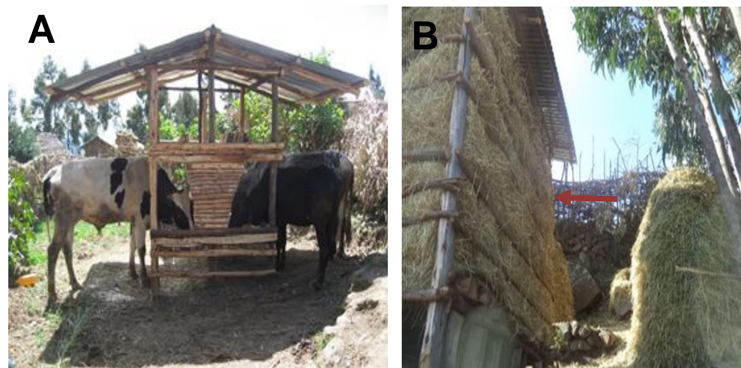
Fig. 2. A) Feeding trough, & B) Storage shed