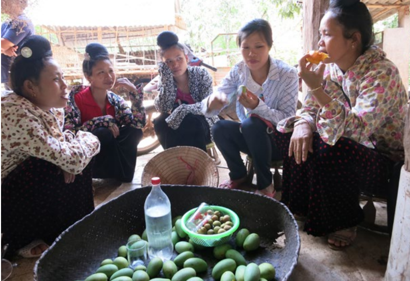
Thai ethnic women eating fruit in Son La, Viet Nam