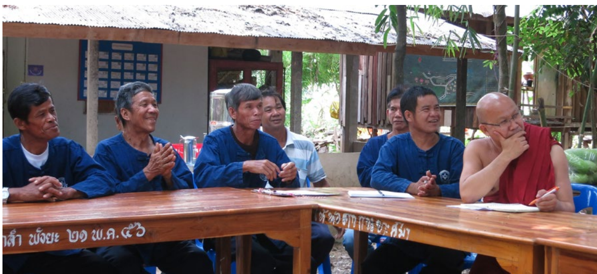
Discussions with monk and farmers at Pong Kham temple, Nan, Thailand

The Greater Mekong region (Cambodia, Laos, southern China, Myanmar, Thailand, and Viet Nam) is characterized by considerable ethnic diversity [1]. Many ethnic minority groups live in remote rural uplands and mountains where the soil is less fertile and the terrain uneven and steeply sloped. Ethnic minorities' social and cultural norms, farming practices, and traditional bodies of agricultural knowledge differ from the lowland ethnic majority peoples who form the political core of Mekong countries [2, 3]. State and private sector programs and policies to promote rural development in the agricultural sector focus on intensifying agricultural