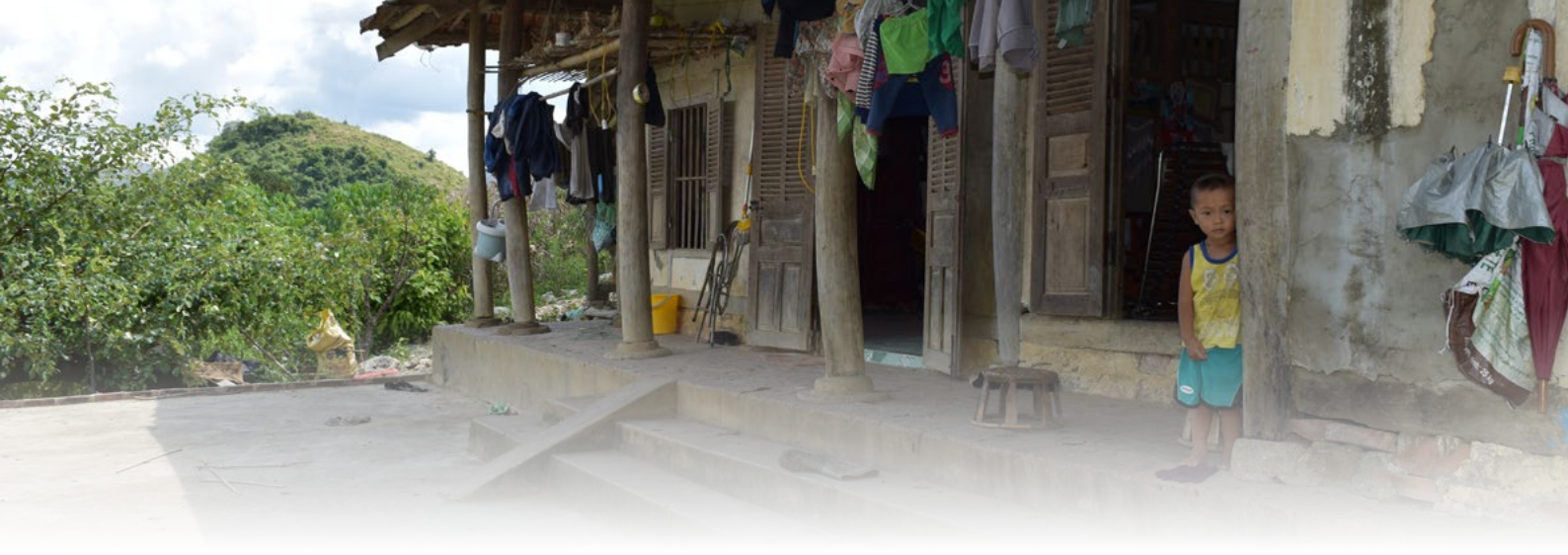
A Thai ethnic minority boy in front of his house in Son La, Viet Nam

groups may not fit with the donor's current orientation toward "efficiency" and short time frames of projects. Discuss and negotiate with donors and host institutions about this different dynamic that such an agricultural R4D entails. If there is no institutional or donor support, transdisciplinary action research that engages ethnic minorities would not be worth starting.