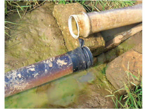
SMALL RESERVOIRS IN THE UPPER EAST REGION OF GHANA SHOWING (LEFT TO RIGHT) SILTATION, DYSFUNCTIONAL DISTRIBUTION CANALS AND DAMAGED IRRIGATION PUMP PIPES.

that are more accessible to women, would encourage them to adopt high value, market-orientated cash crop farming in the dry season. This could significantly improve household incomes and nutrition.