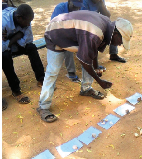
PARTICIPANTS IN NAVRONGO RANKING ECOSYSTEM SERVICES IN ORDER OF IMPORTANCE TO THEM.