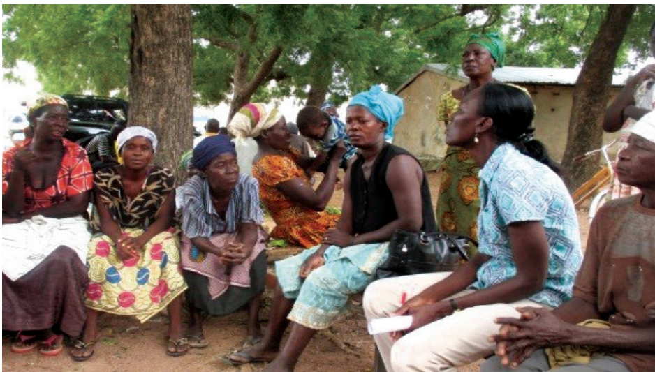
Women's focus group discussions in Winkogo community, northern Ghana.