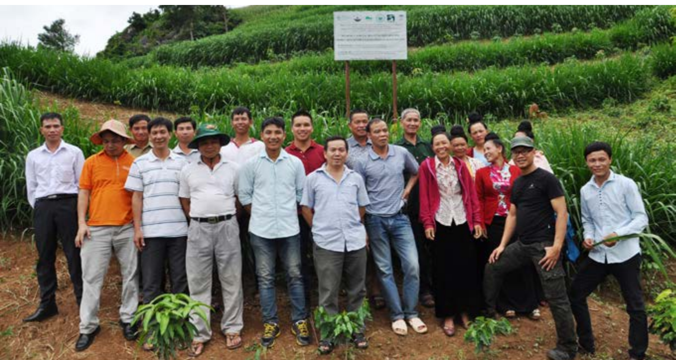
Photo 5.4 Farmer cross visit in Son La, Viet Nam.

We claim that agricultural R4D to improve livelihoods of smallholder farmers would have more impact if it goes beyond simply focusing on agricultural production and includes agricultural R4D activities that strengthen farmers' roles in the value chain. This might take the form of connecting smallholder farmers to markets, supporting the development of entrepreneurship and agribusiness, building social networks for agribusiness, or by improving farmers' capacities to improve product quality and processing. As discussed in Chapter 2, local traditional products, crops and livestock exhibit untapped potential for high-value markets beyond the region, due to their unique characteristics and the value placed by consumers on their origin. It was evident from agricultural R4D on safe vegetables in Northwest Viet Nam that producers have the potential to earn much higher incomes, as long as they are connected to the market. Taking a public-private partnership approach to develop market-driven branding and certification systems could significantly contribute to improving livelihoods, especially of smallholder farmers in upland areas.