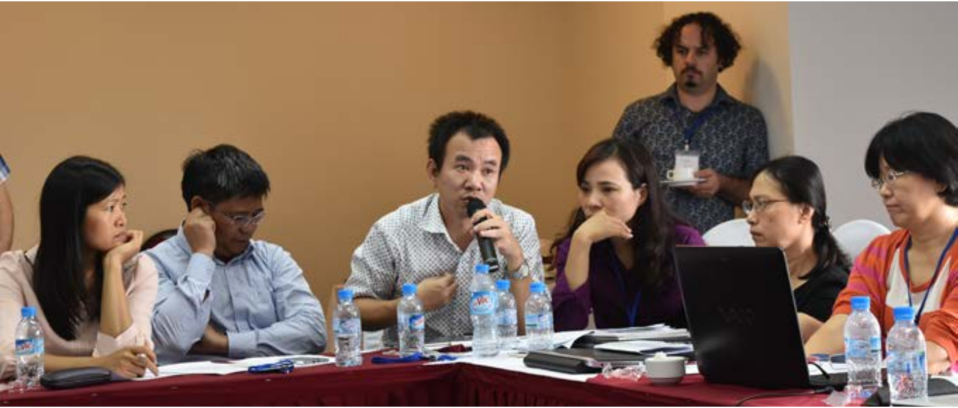
Photo 5.3 Researchers sharing results of discussions at Humidtropics Central Mekong Action Area 2016 planning meeting in Hanoi, Viet Nam, November 2015.

Despite the tremendous ethnic diversity and inequitable development in the region, agricultural R4D activities implemented and interventions proposed under the framework of Humidtropics in the Central Mekong Action Area did not specifically address marginalized groups, most notably ethnic minorities. For example, out of more than 30 R4D activities implemented in the region in 2015, only two directly contributed to the IDO on Gender. Moreover, only one activity specifically mentioned ‘ethnic minority’. This meant that within existing activities, ethnic minorities were either left out, not recognized, or subsumed by the ethnic majority. Thus, the benefits of Humidtropics research and interventions may not have reached the poorest smallholder farmers in the region, and if they did, may have been inappropriately designed and potentially led to exacerbated negative impacts on cultures and livelihoods by introducing new technologies that go against social norms, rules and ways of engaging in agriculture (Kawarazuka 2016).