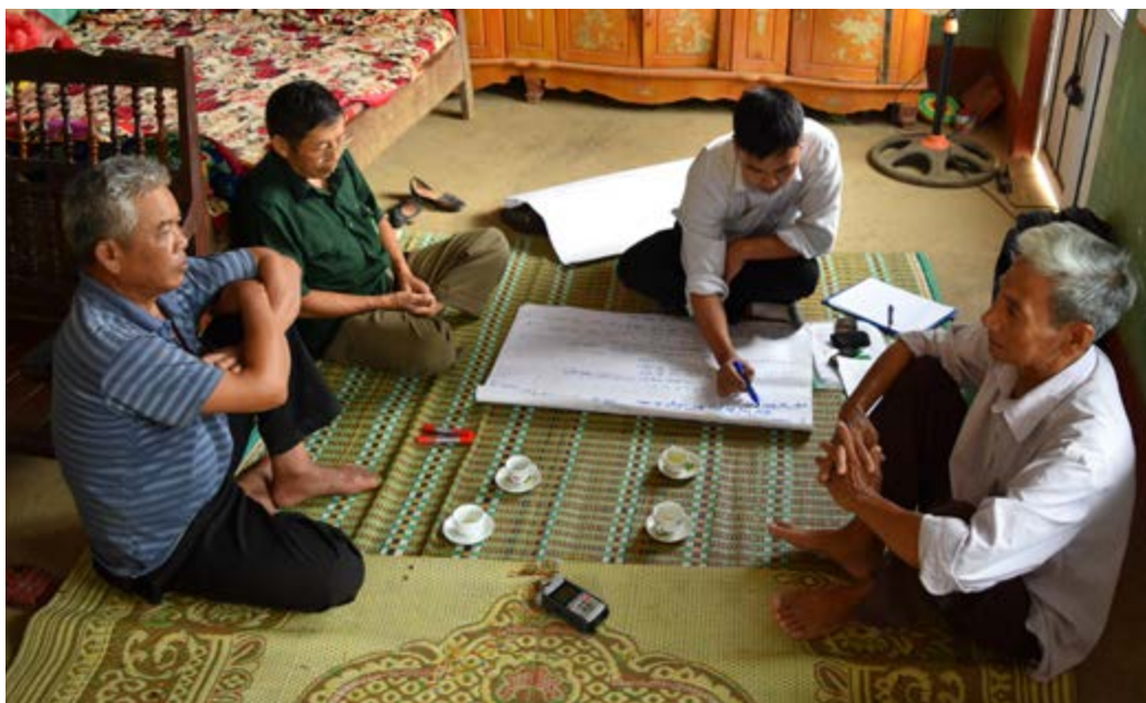
Photo 5.2 Focus group discussion with male farmers in Son La, Viet Nam.

The first constraint was related to budget. The Humidtropics budget was repeatedly cut, with a smaller budget allocated each year. Although all 15 CRPs suffered budget cuts, these cuts affected some CRPs more than others. Such uncertainties in core funding made many Humidtropics international partners shift their priorities, which inevitably left Humidtropics and other systems research CRPs with even less resources to achieve their ambitious goals.