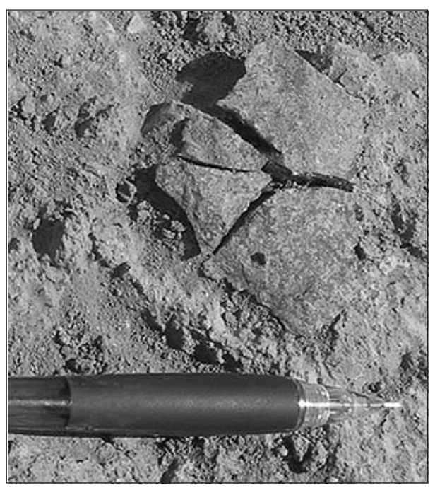
Fig. 3. A snapped flake in situ.

Fig. 2. A cracked flake in A.L. 894, before it was completely exposed in the excavation.