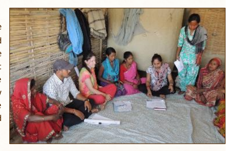
Step 2: Ask for a volunteer to take notes while participants share ideas.

Step 1: Explain to participants that unlike some trainings, this workshop is not supposed to fix the problems in one day. Also unlike some trainings, the facilitators do not have all the answers. Emphasize that the workshop was only the first step, and now it is time for the participants to share what they learned with their friends and families and continue the conversation.