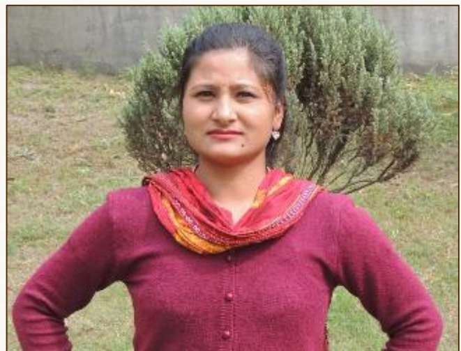
Step 2: Explain: "Imagine that you spoke to a doctor and due to a medical condition, you can only have one child in your life. Would you prefer a boy or a girl?" (represented by the pictures of the man and the woman).