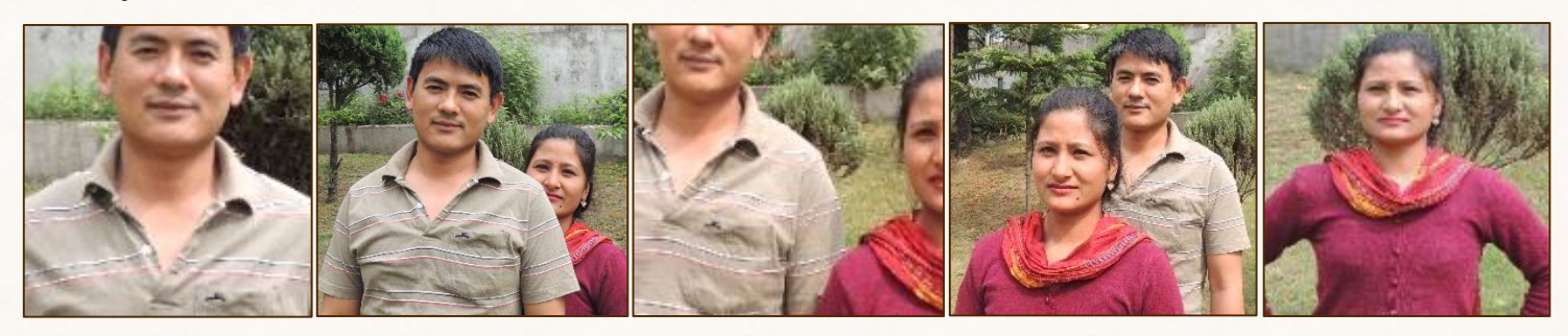
Step 2: Describe the row of pictures, saying how it represents male labor, mostly male labor, labor shared by both genders, mostly female labor, or female labor.