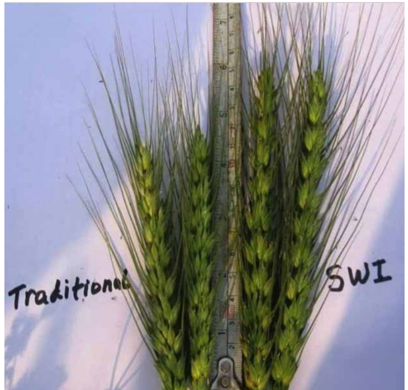
Figure 18: Comparison of wheat panicles from farmer field school trials in mid-Nepal.

In 2011-12, farmer field school experiments conducted in Sindhuli district with similarly modified SWI practices also showed better yield and economic returns. Pre-germinated seed of Bhirkuti variety sown at 20x20 cm spacing gave 54% more yield than the available ‘best practices’ used under similar conditions of irrigation and fertilization: 6.5 tons/ha from SWI, compared to 3.7 tons/ha with conventional broadcasting, and 5 tons/ha with row sowing (Adhikari 2012).