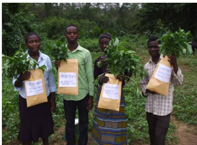
Figures 31 and 32: Top, vegetable seed sowing in a farmer-participatory SCI trial with green leafy vegetables in Ibadan, Nigeria; bottom, Corchorus olitorus (jute mallow) with SCI management at Ajibode, Ibadan, Nigeria.

Nigeria: Green leafy vegetables are often overlooked in considerations of how to improve vegetable production, even though these are very important parts of people's diets in much of Africa and many parts of Asia, and particularly in the Caribbean and Pacific Islands. The leaves and shoots of Celosia argentea , a member of the amaranth family, as well as the leaves of a mallow plant, Corchorus olitorus , whose fibers are used as jute, are eaten in Nigeria and other parts of the forest zone of West Africa. Poor soil fertility is known to limit the yields of these crops, but SCI experience is showing that production is constrained also by planting these crops too densely.