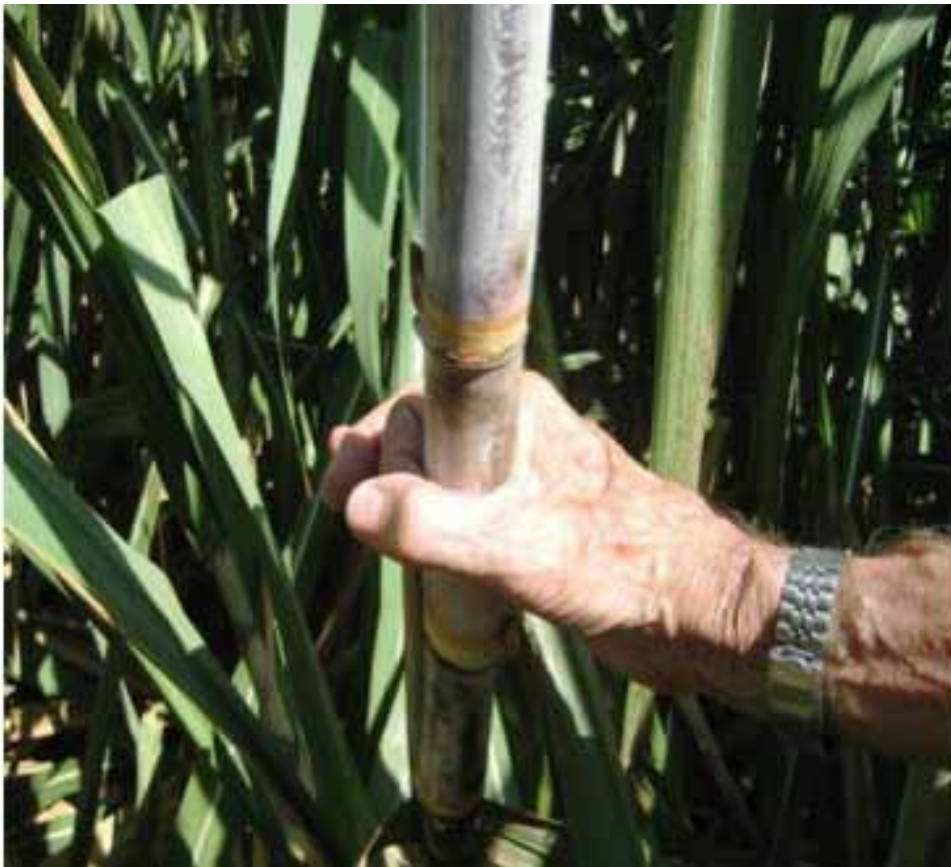
Figures 23 and 24: First SSI trials at the CPA Camilo Cienfuegos sugar cooperative in Bahia Honda, Cuba, at 10.5 months; yield from the test plot was estimated at 150 tons/ha.