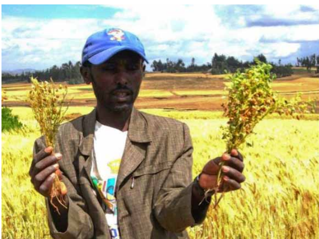
Figures 29 and 30: Top, chick-peas growing in Dangs district, Gujarat state of India – note differences seen in the size of the grains – conventionally-grown grains on the left, SCI grains on the right; bottom, an Ethiopian farmer in Gimbichu district holding up two lentil plants to show the increases possible in number of stems and number of pods per stem using SRI ‘planting with space’ methods. The plant on left was grown with conventional practices, the plant on the right with SCI practices.

establish single plants at wide (50x50 cm) spacing, followed by 3-4 periodic weeding with a soil-aerating implement. Other new practices are regular use of a traditional organic pesticide known as amrut pani at 15-20 day intervals, and timely nipping (removal) of budding leaves to keep the plant from becoming too bushy. This directs the plant’s nutrient supply to a limited number of branches so that these become more productive than if many branches are competing for nutrients.