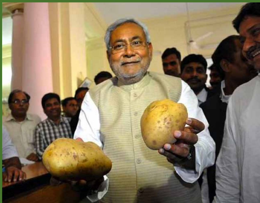
Figure 33: Former Chief Minister Nitish Kumar of Bihar State, India, holding 1-kilogram potatoes grown in Darveshpura village, Nalanda district of his state.

The soil we should note was relatively rich in silicon, an element often neglected. Although not considered as a nutrient, it is essential for plant growth. Like other farmers in the village, Kumar acknowledged having been influenced by the new knowledge coming into his village from SRI training, and his practices represented an adaptation of agroecological principles.