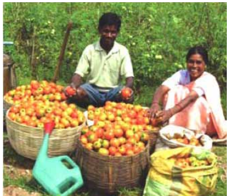
Figures 5 and 6: Applications of SCI ideas to vegetable production in Bihar state of India: at top, profuse branching of eggplant (brinjal) plants under SCI management; at bottom, SCI tomatoes ready for market.