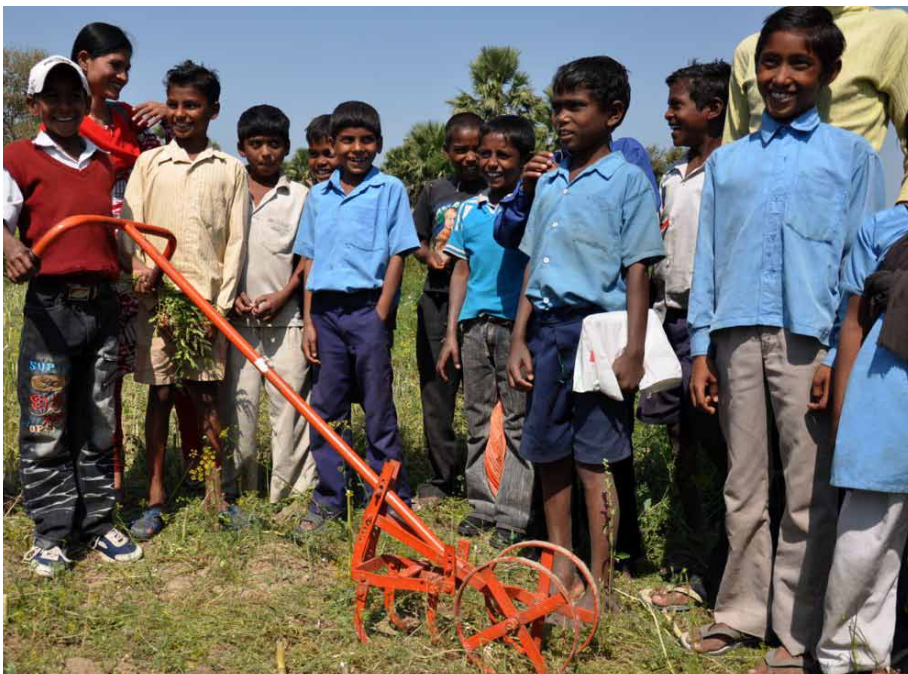
Figure 2: Children in Gaya district of Bihar state of India admiring and playing with a simple mechanical weeder used for controlling weeds and aerating the soil when producing mustard (rapeseed or canola) with SCI methods.

The results of SCI practice -- producing more food outputs with fewer inputs -- will appear counter-intuitive to many readers, maybe even to most. But this reorientation of agriculture is what ‘sustainable intensification’ will require as our populations get larger and as the resources on which they depend become relatively, and in some places even absolutely, more limiting.