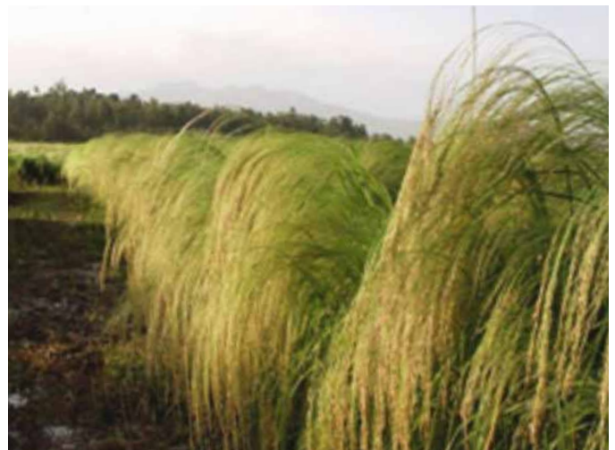
Figures 25 and 26: Top, comparison of a transplanted STI plant on left, and a broadcasted tef plant on right, both same variety; bottom, STI tef crop ready for harvest at Debre Zeit Research Station in Ethiopia.