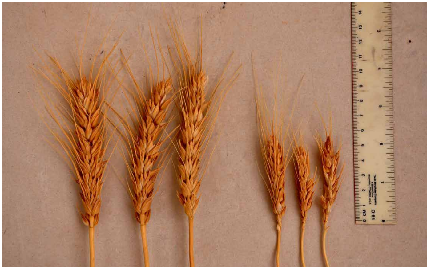
Figure 17: Comparison of SWI panicles on left and conventionally-grown wheat panicles on right, from 2009/10 trials in Timbuktu region of Mali.

2010). While a spacing of 15x15 cm gave the highest yield (5.4 tons/ha), all of the treatments using single plants per hill gave yields above 4 tons/ha, with spacing ranging from 10x10cm to 20x20cm, as did row-planting with 20 cm distance between rows (Figure 17). These yields were all higher than the 2.22 tons/ha obtained from the broadcast control plots where farmers' usual methods were used (Styger, Ibrahim and Diaty, unpublished).