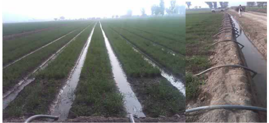
Figure 43: Irrigation done by syphon tubes in furrows between permanent raised beds, saving both water and energy.

fertilizer and compost (Figure 44, following page). Quick and efficient crop establishment was done by a second machine which punched holes in the raised beds at regular intervals and then filled them with water from a tank on the machine, after laborers riding on the machine had dropped 10-day-old seedlings into them (Figure 45, following page).