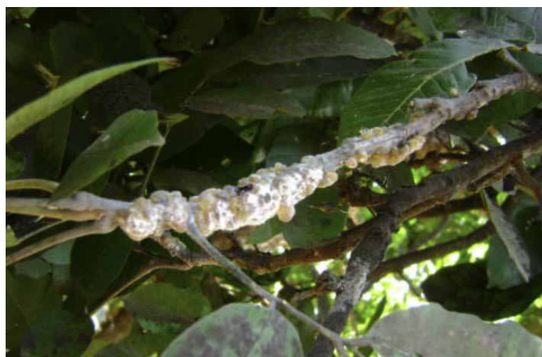
Figures 40 and 41: On top, a farmer showing resin excretions of lac insects with the locally-devised System of Lac Intensification in Khunti district, Jharkhand state, India; on bottom, mature lac ready for harvest on a kusum tree.