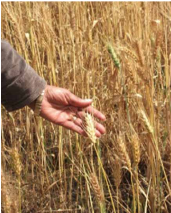
Figures 19 and 20: Comparison of wheat panicles from the same variety in Gembichu Woreda, Ethiopia: on left are plants grown with usual farmer methods of cultivation (39 grains per panicle on average); and on right, SWI crop management (56 grains).

That SRI methods which could enhance the productivity of rice plants would have similar effects on finger millet and wheat was not so surprising as they belong to the same large family of grasses known as Gramineae (or Poaceae) in which rice is placed. However, learning that concepts and adapted methods from SRI cultivation could be successful also for a crop as ostensibly different as sugarcane, discussed next, was unexpected. Botanically speaking, sugarcane is also a member of the Gramineae family, and its productivity is similarly enhanced by more profuse tillering and root growth.