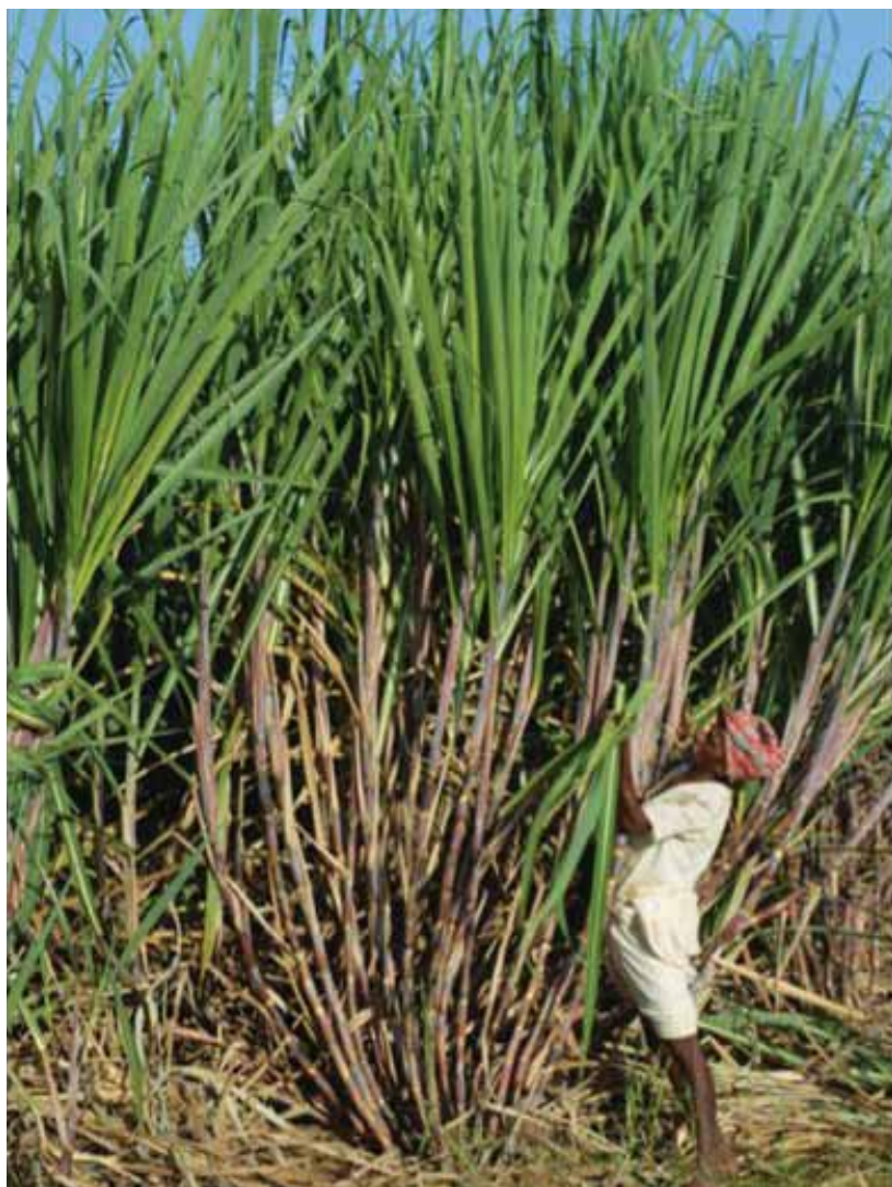
Figure 22: Sugarcane being grown with SSI management in India.

The Tamil Nadu state government has agreed to extend financial and technical support to farmers wanting to utilize SSI methods as it did previously in the case of SRI. The Tamil Nadu Agricultural University, having launched an SSI promotion campaign, reports that the new methods are raising average cane yields up to 225 tons per hectare, from present yields of 100 tons. This is achieved by reducing the seed rate by >90%, planting 12,500 single bud chips per acre instead of 75,000 double-budded chips as is usually done now (Anon. 2013b; Anon. 2013c).