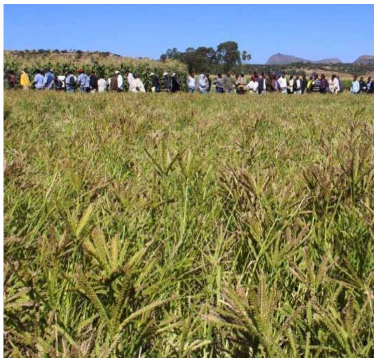
Figure 11: Field day for farmers, technicians and officials to observe SRI finger millet being grown in Tigray province of Ethiopia.

This was considered quite fantastic, evoking curiosity and interest among farmers there and elsewhere in Ethiopia. This management strategy has come to be called 'planting with space,' and farmers are now applying its concepts and principles to many other crops as reported in section 5 below.