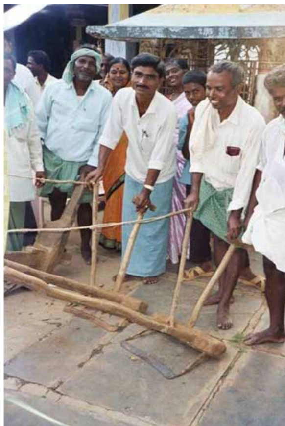
Figures 9 and 10: On left, demonstration of the korudu implement that Indian farmers in the Haveri district of Karnataka state use for bending over young finger millet plants to promote the growth of roots and tillers; right, farmers demonstrating the yedekunte implement that is used to cut weeds' roots below the soil's surface between the rows. This has the additional benefit of breaking up and aerating the top layer of soil around plants' roots.

At each intersection of the grid, two 12-day-old seedlings are transplanted, putting a handful of compost or manure around the roots to give the young plants a good environment in which to begin growing.