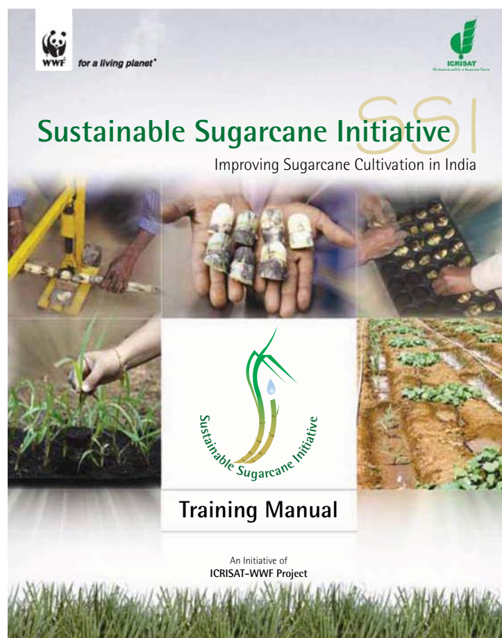
Figure 21: The cover of a 2009 SSI training manual, published by WWF and ICRISAT.

Large-scale field testing of SSI methods has been undertaken in all the major sugarcane-producing states of India. Currently it is estimated that at least 10,000 Indian farmers are practicing SSI, although this is still small compared to the large total numbers cultivating 5 million hectares of sugarcane. AgSri and the National Bank for Agriculture and Rural Development (NABARD) have jointly published a revised SSI manual (AgSri/NABARD 2012).