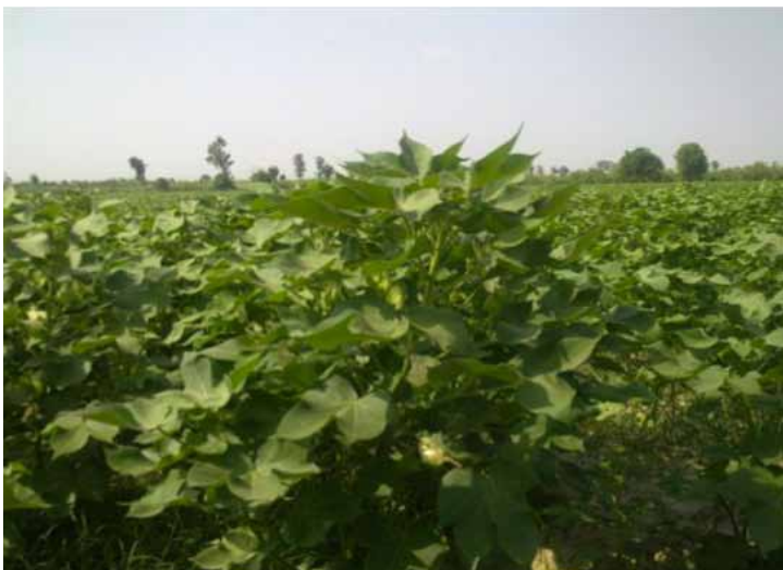
Figure 47: This cotton crop at a Department of Agriculture research station in Punjab, Pakistan, is at flowering stage, with no fertilizer or pesticide having been used.

There are strong financial interests in Pakistan as elsewhere promoting input-intensive modes of production and favoring new seed varieties that demand more and more purchased inputs. Now there are counter-currents, however, favoring environmental health and boosting smallholder farmer incomes currently constrained by high input costs. The On-Farm Water Management Department of the Provincial Department of Agriculture now has an SCI cotton demonstration in the 2013-14 season (Figure 47).