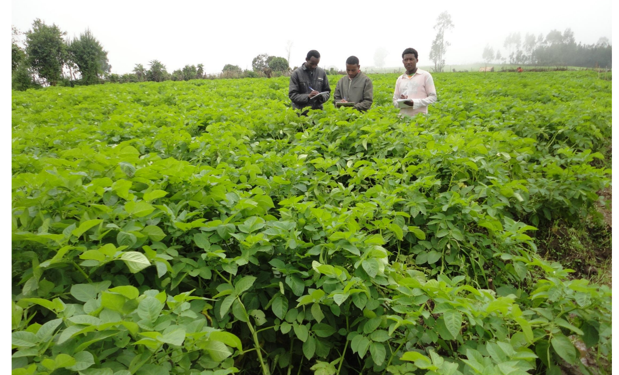
QDPM field inspection