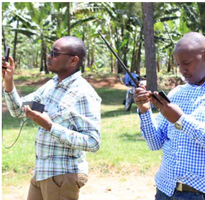
The project team in Uganda: ensuring adequate internet and data reception