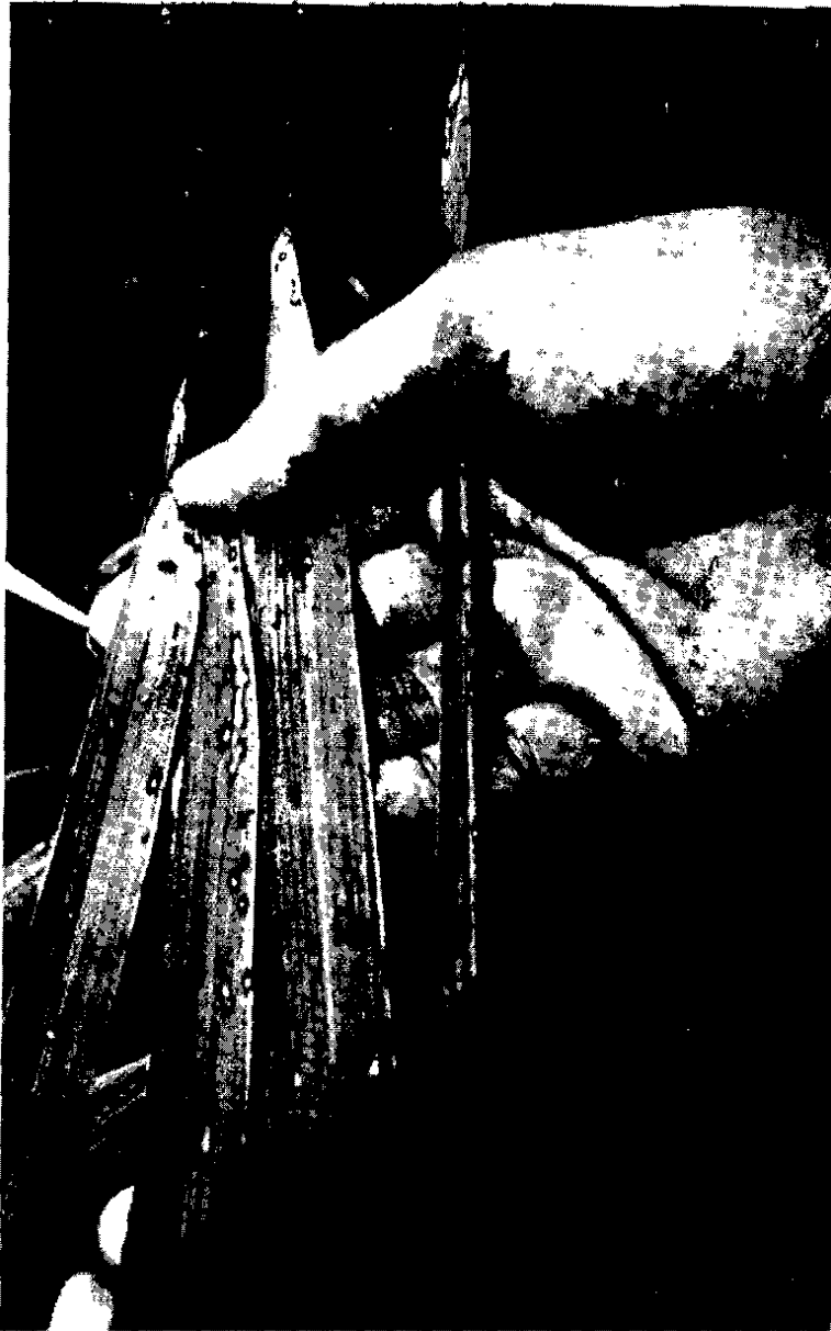
Figure 4. Symptoms of Alternaria padwickii in line CNAX 791059 in Rondonópolis.