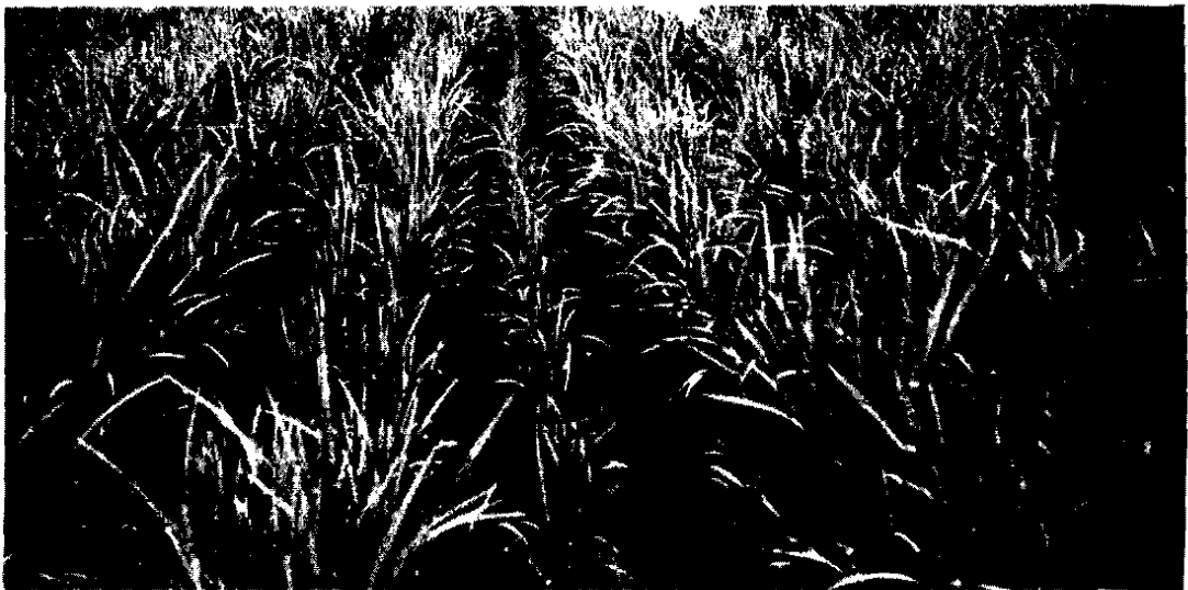
Figure 5. Poorly developed row of plants in the middle, left without fertilization by mistake in a commercial plantation. It shows by contrast the very good response to fertilization from the rest of the crop.