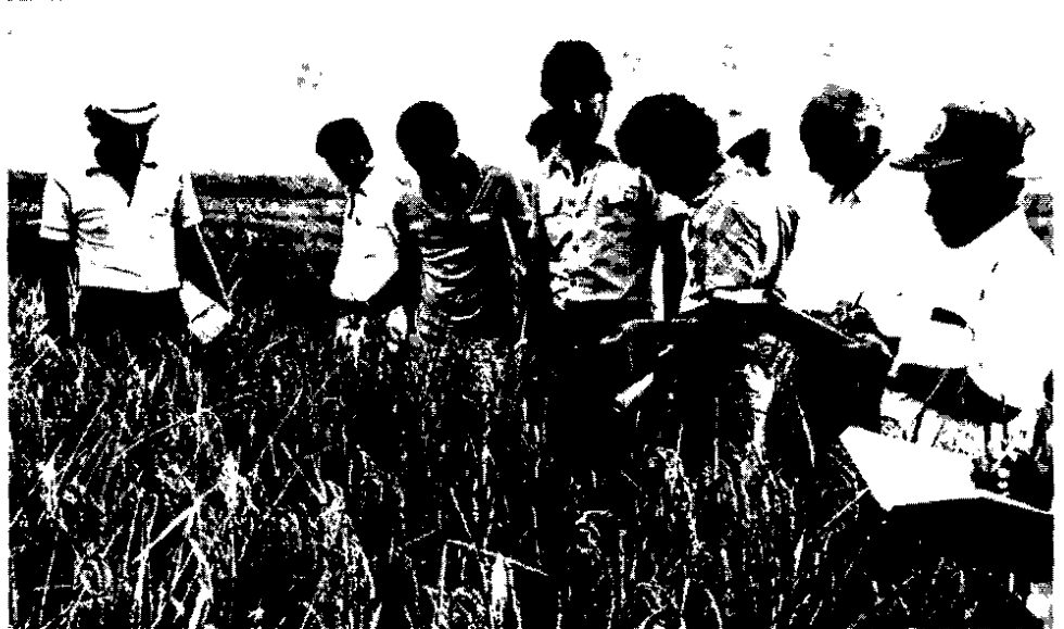
Figure 2. Two monitoring team members and EMPA technicians evaluating an upland rice crop.