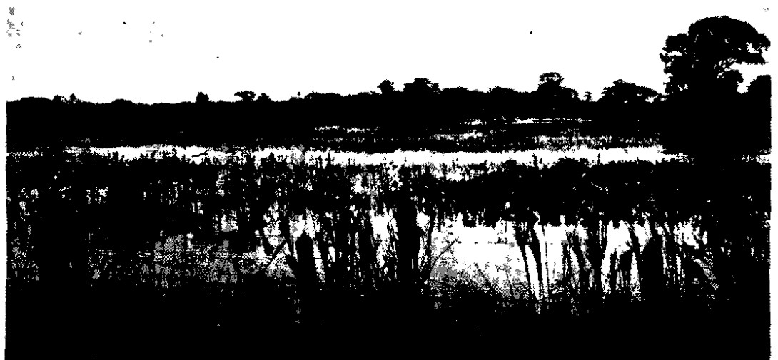
Figure 3. Pantanado is a lowland area subject to flooding where rice research is second in priority after cattle raising, buffaloes and pastures.