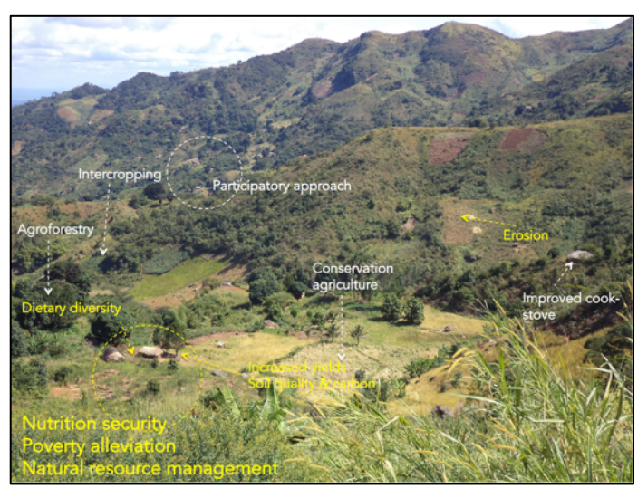
Figure 1. Examples of climate-smart practices (white text) leading to food and nutrition security and poverty alleviation (yellow text) in the Uluguru Mountains, Tanzania.

This question, however, presents a false choice. By definition, CSA is context specific and subject to the priorities of farmers, communities, and governments where it is being implemented. Until now, little empirical evidence has been put forth to systematically evaluate what CSA practices work where. Instead, CSA is often supported with case studies, anecdotes, or aggregate data, which paint an incomplete picture of both the potential and challenges of CSA.