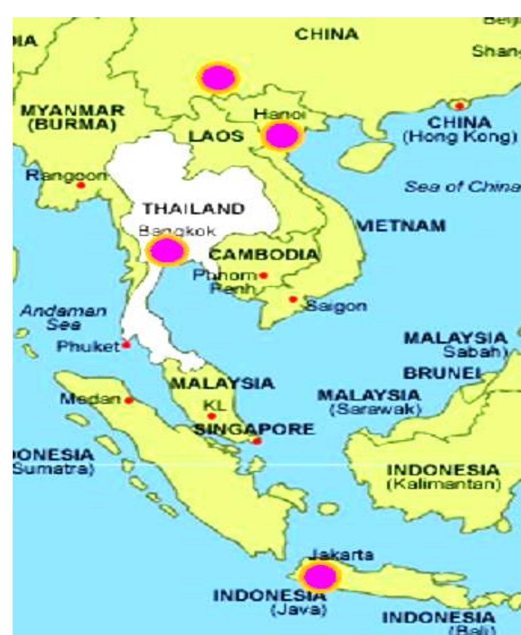
Red dots indicate study sites