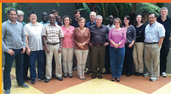
Fig. 1 The research team at the GT4SP Start-Up meeting in San Diego, USA

A new four year investment to develop genomic and genetic resources for sweetpotato improvement has been launched with the goal of establishing a molecular marker-assisted breeding program in sweetpotato.