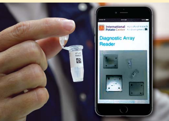
Fig. 1 Prototype of Vrius Diagnostic Reader on Smart Phone

Genomes of virus species and strains infecting sweetpotato in East, Southern and West Africa have been determined by next generation sequencing. A new diagnostic tool to detect all sweetpotato viruses simultaneously has been developed and will be progressively improved.