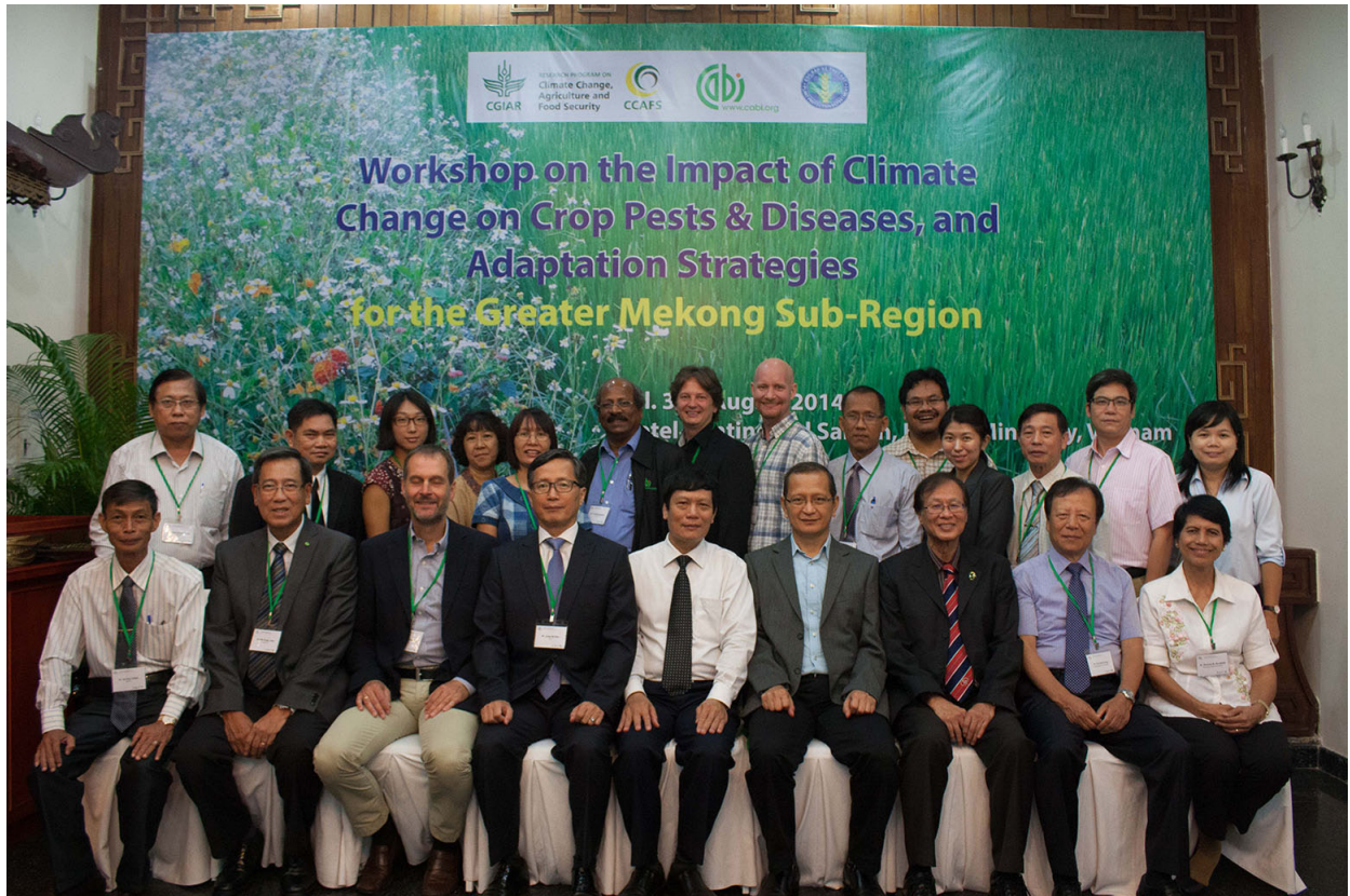
Fig. 9 Participants of the 'Workshop on the Impact of Climate Change on Crop Pests & Diseases and Adaptation Strategies for the Greater Mekong Sub-region