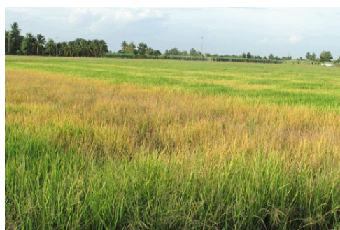
Fig. 10. Heavy hopper burn in Sam Chuk district

At the moment, farmers' pest management practices and pesticide use are causing environmental and human health concerns in food crop agro-ecosystems. Climate change is adding new dimensions to the multiple challenges agricultural policy makers and farmers are facing. However, links between climate change and pest scenarios are not well known, and much less known are adaptation options that may be adopted by agricultural policy makers and farmers to reduce vulnerability of crops to abnormal pest infestations and to build resilience against climate change induced pests and diseases.