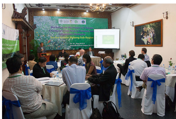
Fig. 1. Workshop in progress

This event brought together leading experts on pests and disease management, including national partners to discuss how agriculture, farmers in particular, can cope with the challenges brought about by climate change. Amongst the primary concerns were to identify and address the most important interactions, synergies and trade-offs among climate change, agriculture and food security. Over 20 participants from countries mainly in the GMS region, took part in the workshop. Participants included experts in climate change from key CGIAR Centers such as IRRI and CIP, FAO- United Nations, GMS-based National Research Organizations, Universities and CABI.