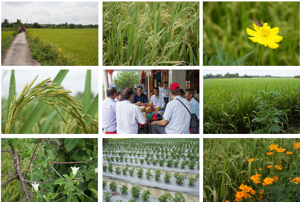
Fig. 12. Field trip to Tan Hoi Dong village

The farmers grow nectar-rich flowering plants on the bunds and abstain from insecticide use in early crop stages. The flowers will provide shelter, nectar and alternative hosts and pollen to conserve and augment natural biological control services.