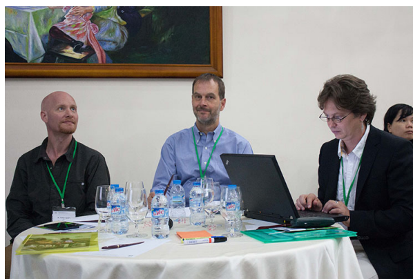
Fig. 6 Participants listening to the technical sessions