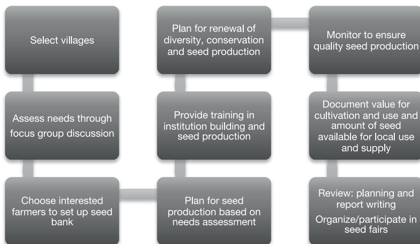
Figure 19.1 Steps in setting up and maintaining a community seed bank