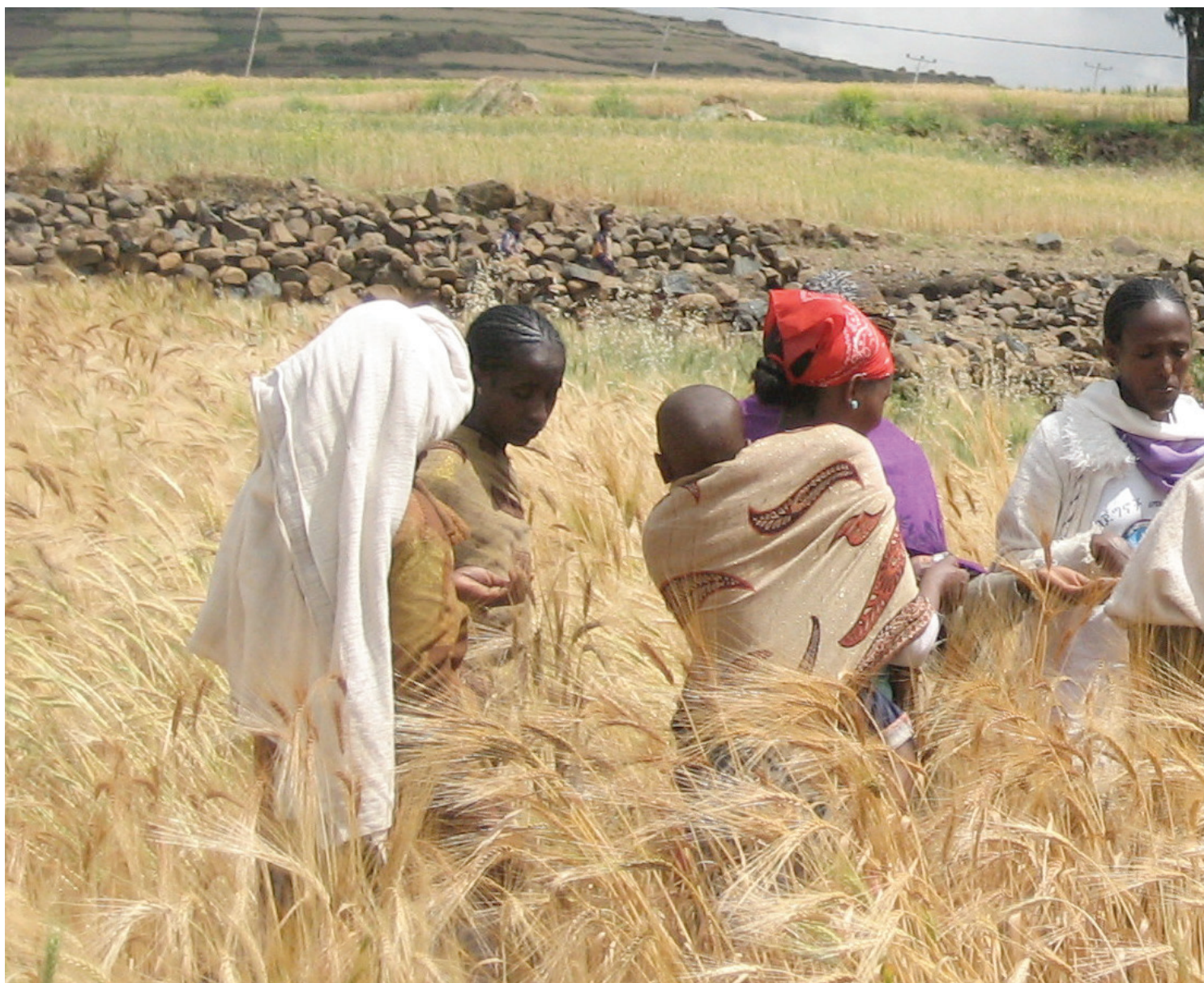
Fig. 2 - Farmers, with the support of scientists, evaluate varieties in the field.

The initiative shows how involving farming communities can contribute to scientific knowledge and potentially to breeding programmes. Our approach, which is able to map farmers' preferred traits in the genome, can serve as the basis for marker-assisted participatory breeding, linking breeders' and farmers' goals. At the same time, the large genetic diversity of Ethiopian landraces is an important global resource for breeding.