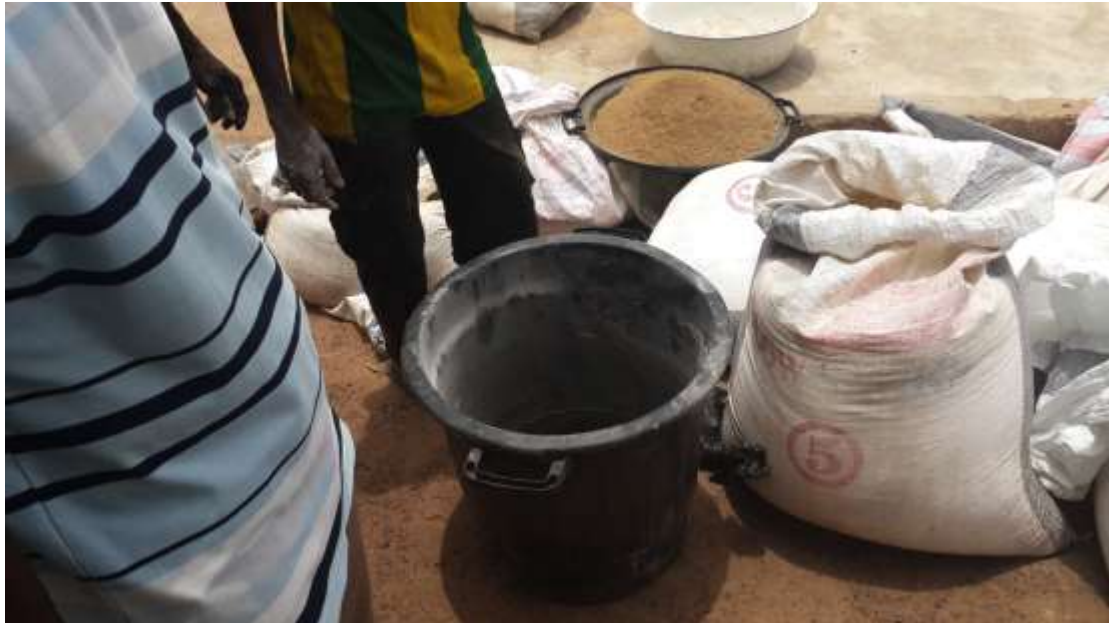
Standardized container for measuring feed ingredients