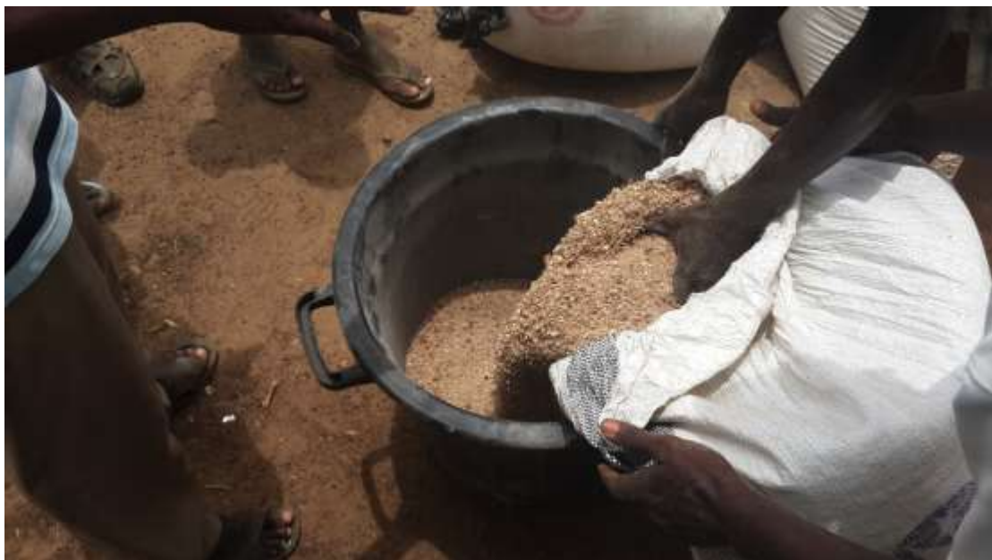
Measuring feed ingredients