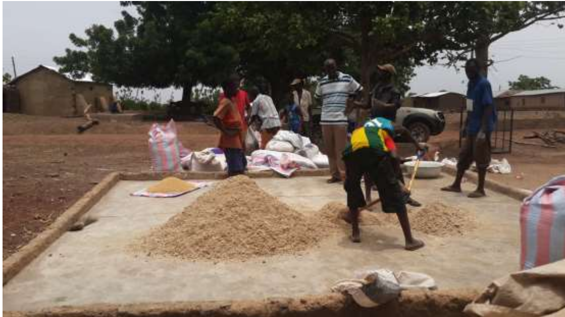
Farmers try their hands at mixing feed