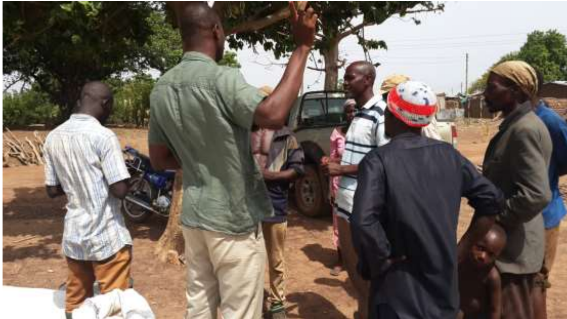
Project personnel interacting with farmers