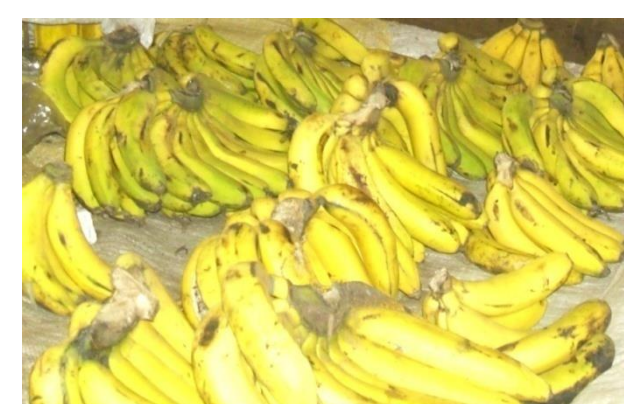
Fig.1: Some of the products sold in local markets