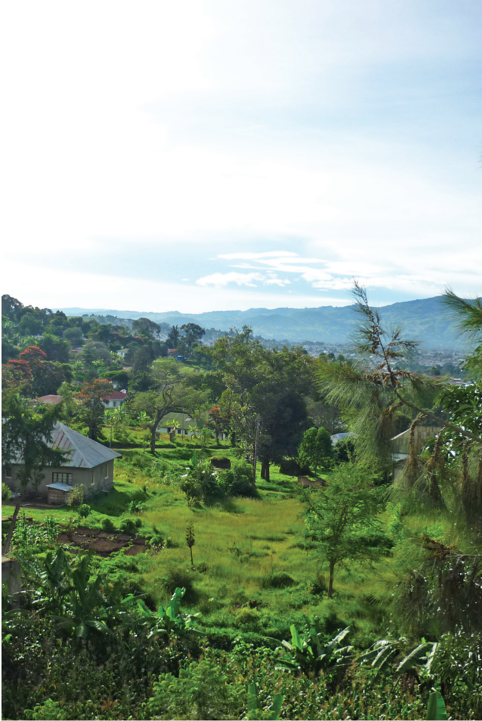
Landscape in Mbeya, Tanzania.