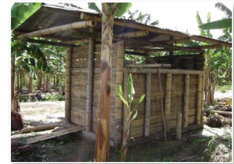
Figure 4. Walls and roof of the compost shelter.