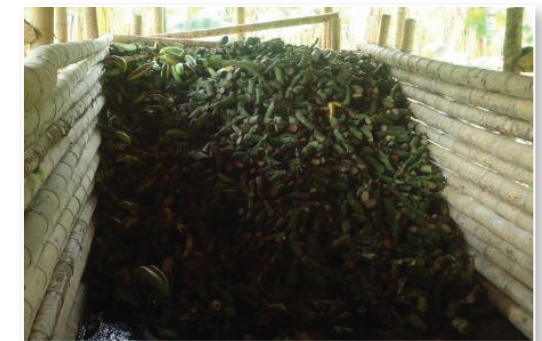
Figure 5. Rachis stored inside the shelter.

Rachis of recently harvested bunches are selected, discarding those showing symptoms of Moko disease. The selected rachis are then chopped into pieces and placed in the compost shelter (Figure 5).