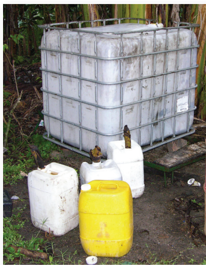
Figure 6. Lixiviates stored in plastic containers.

Because they are highly corrosive, store lixiviates in lidded or capped plastic containers, not metal ones (Figure 6). Leave the lixiviates to rest, or cure, for at least 30 days before use.