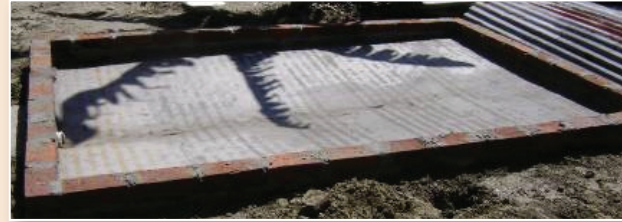
Figure 2. Floor surface of a rachis compost shelter.