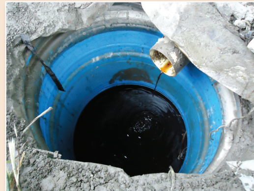
Figure 3. Drainage pipe and collecting container.