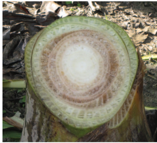
Necrosis in vascular bundles.