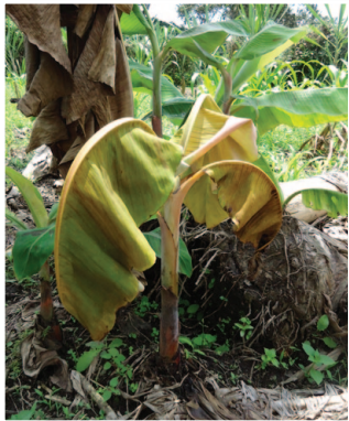
Wilting and necrosis in plants but note the asymptomatic suckers.