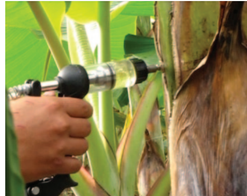
Eliminating plants from the Red Zone.