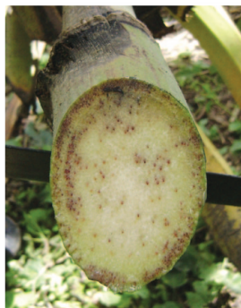
Necrosis and blocking of vascular bundles in the floral rachis.