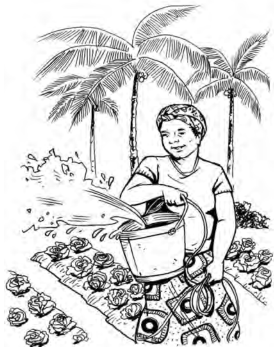
Using a bucket for irrigation in Keta, Ghana

The data suggest that a pattern of growth is emerging in which productivity and gender equality mutually reinforce each other. Agricultural support agencies will better achieve their goals by addressing structural disadvantages for women such as access to high-performing irrigation equipment, land, technical training and forward (e.g., output markets) and backward (e.g., inputs) linkages. This approach fully aligns with the aims of policies towards gender equality.