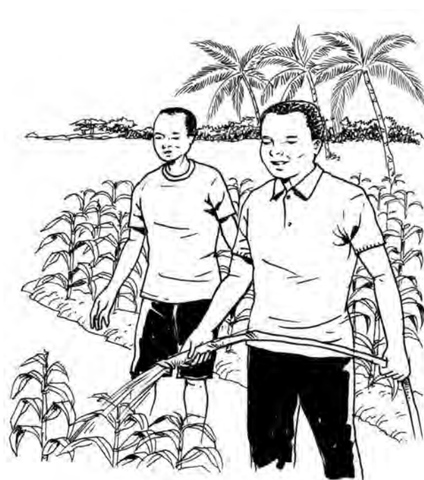
Farmworkers using a hose connected to a powered pump for irrigation, Keta, Ghana