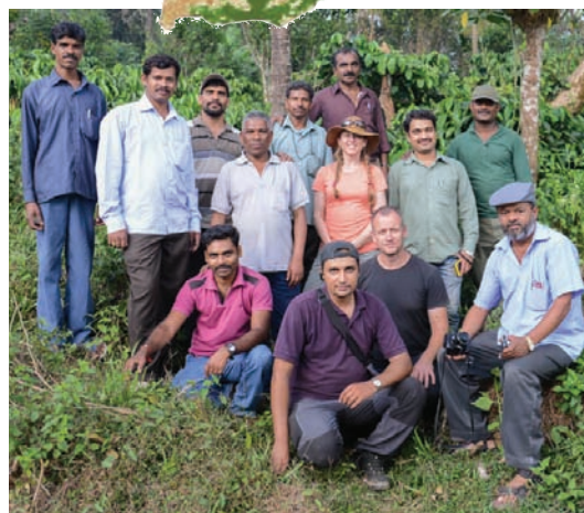
Photo Right: Field training participants at the Madikeri landscape.

Data collected in the systematic biophysical and socio-economic field surveys in the WGSL will feed into a global database for all the FTA Sentinel Landscapes. This will enable us to conduct cross-site comparisons of ecosystem health, tree cover and tree cover transitions.