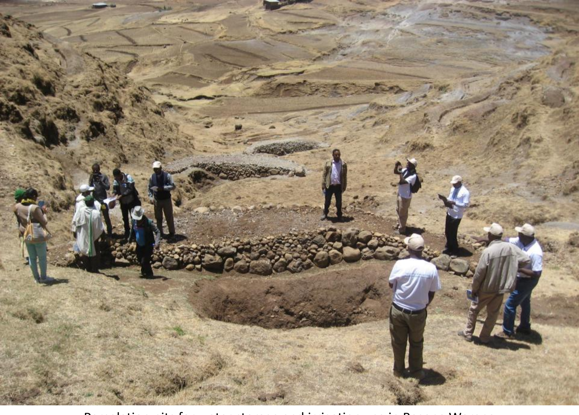
Percolation pits for water storage and irrigation use in Basona Worena