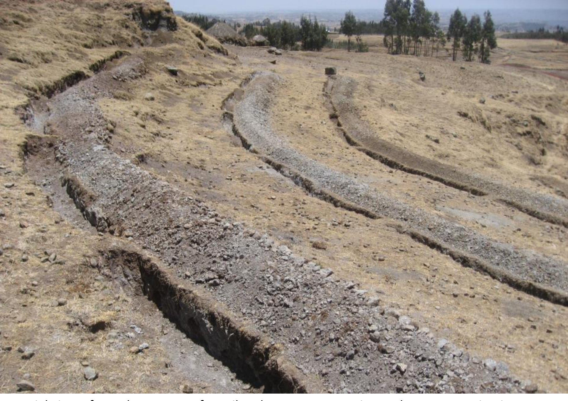
Partial view of trench structures for soil and water conservation and water retention in Basona Worena