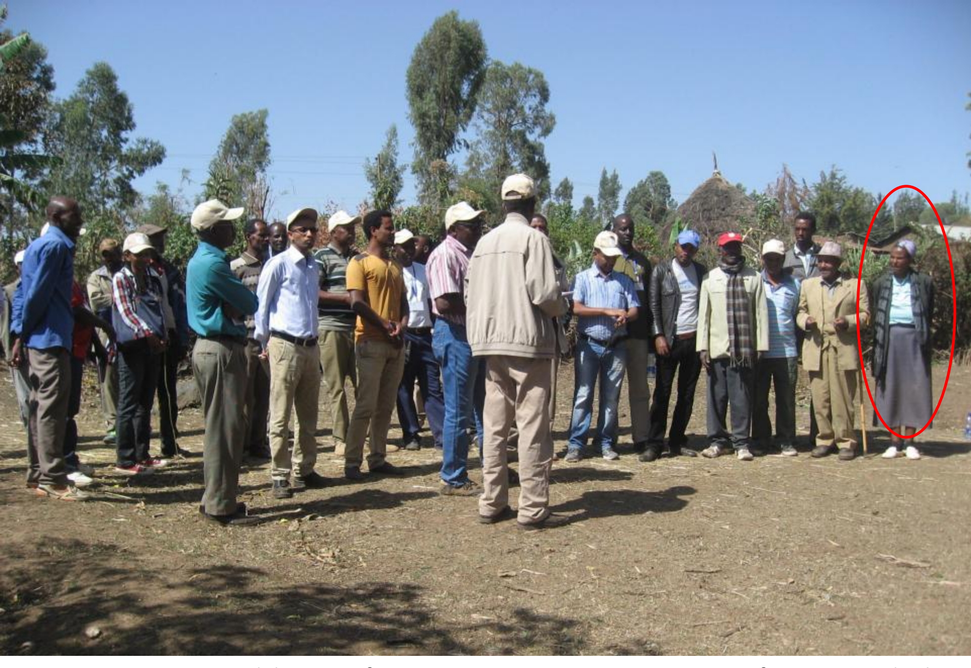
Visitors encourage a model woman farmer on water management, growing fruit trees and other project interventions in Lemo