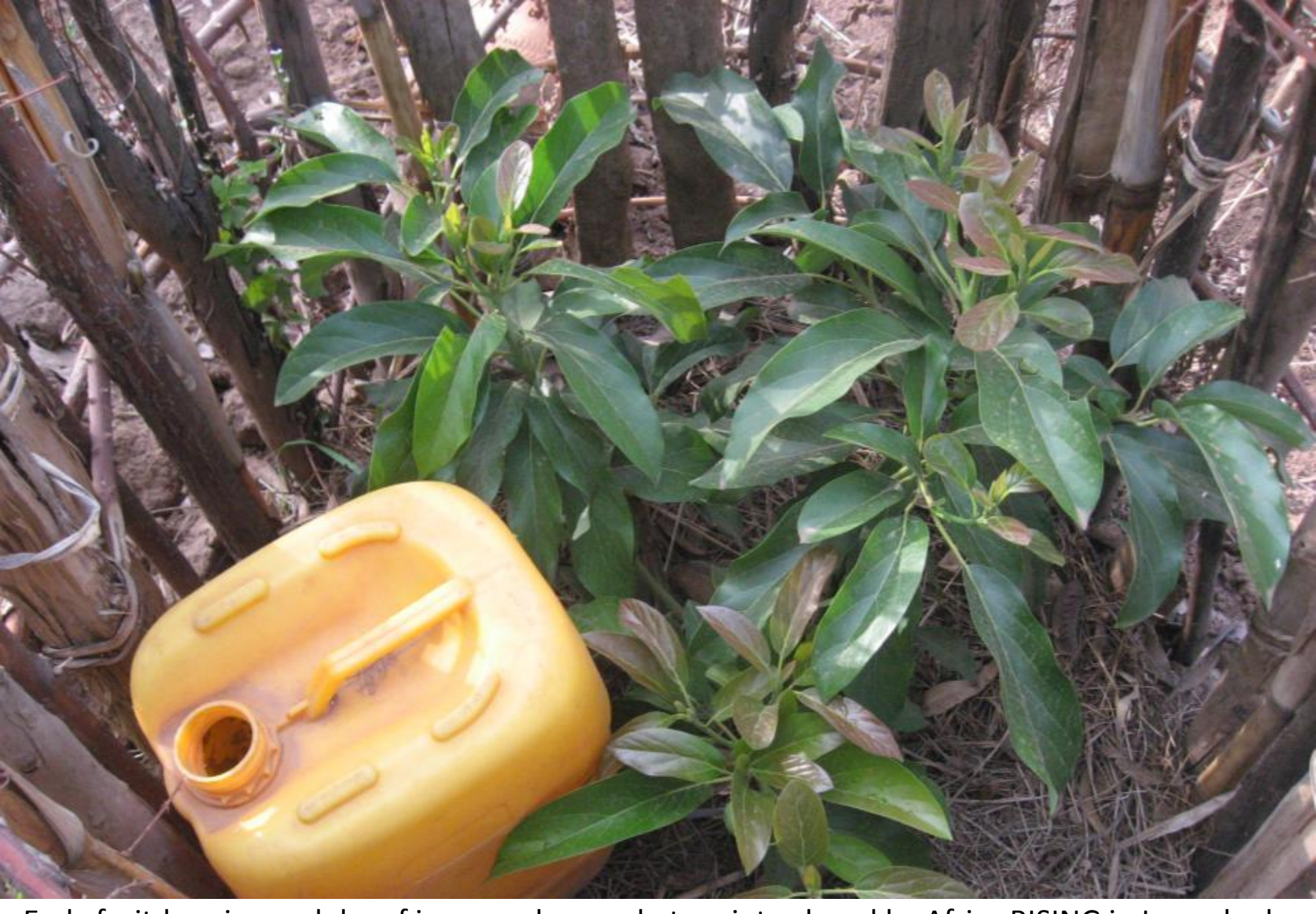
Early fruit-bearing and dwarf improved avocado tree introduced by Africa RISING in Lemo looks healthy because of farmers' innovation on watering and management systems