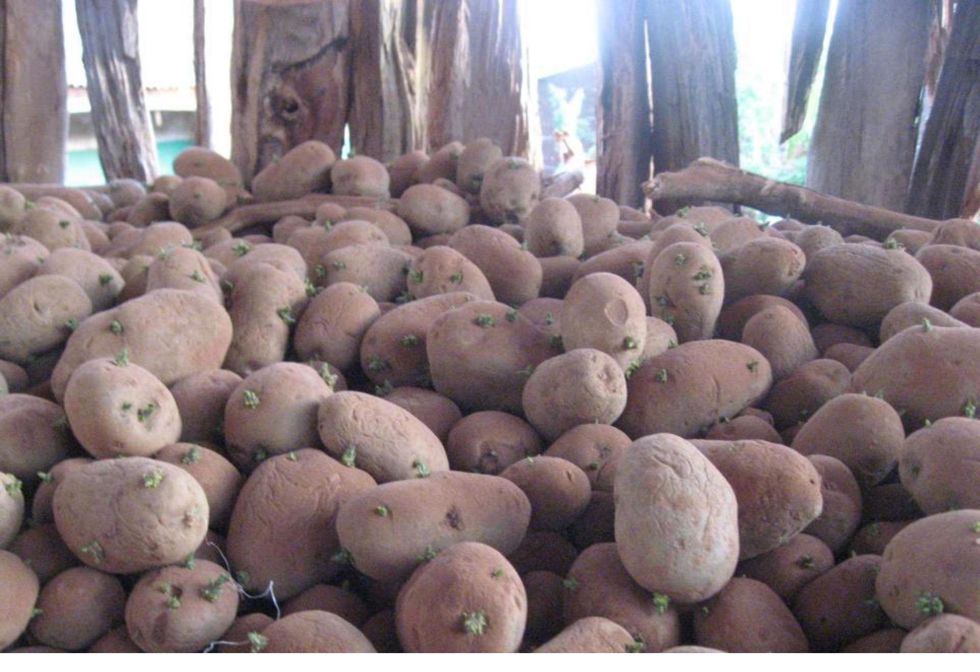
A woman farmer in Upper Gana kebele (Lemo) stored potato tubers in a DLS after selling over 23,000 ETB (USD 1150)