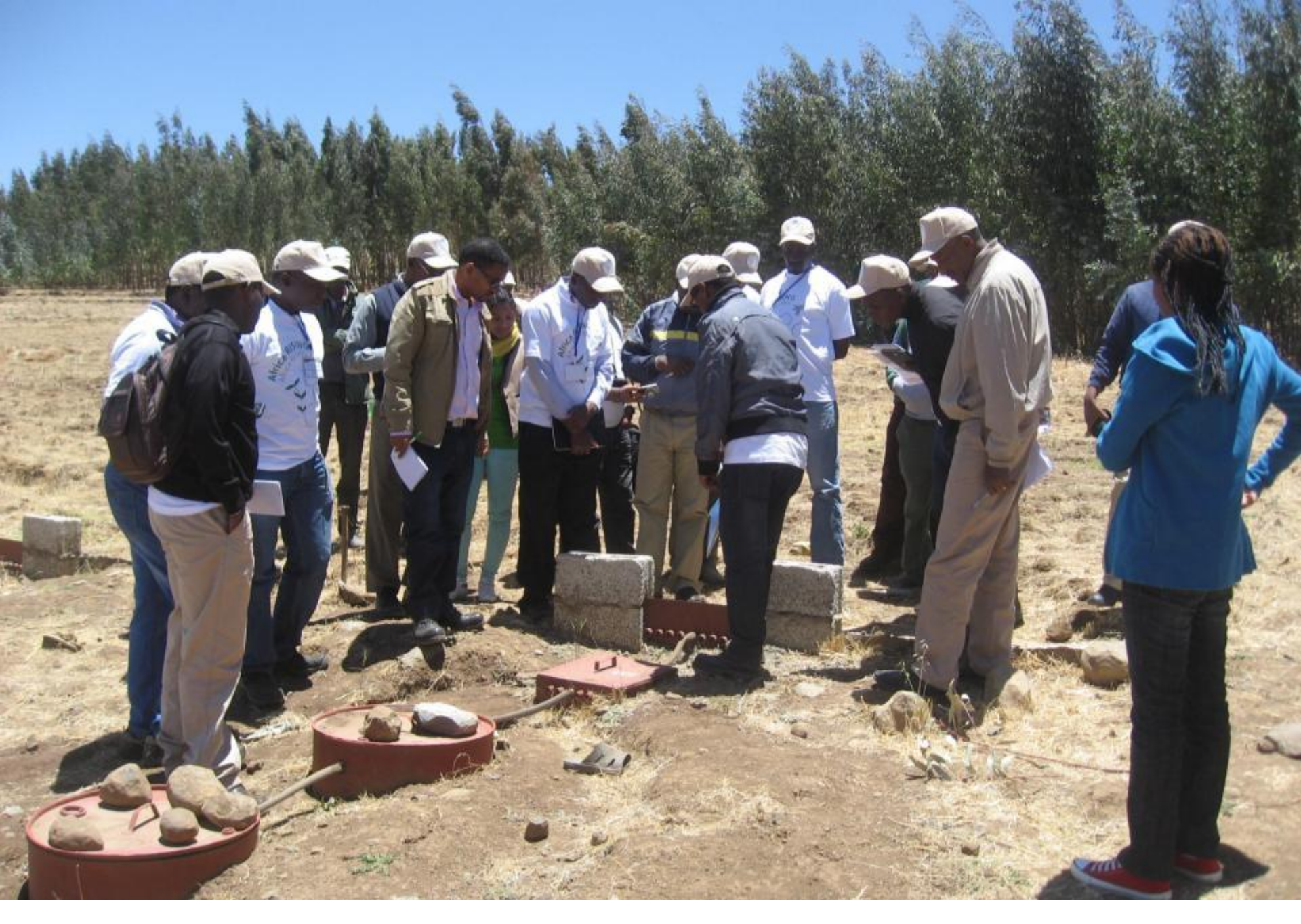
Runoff assessment plots at the model watershed in Basona Worena