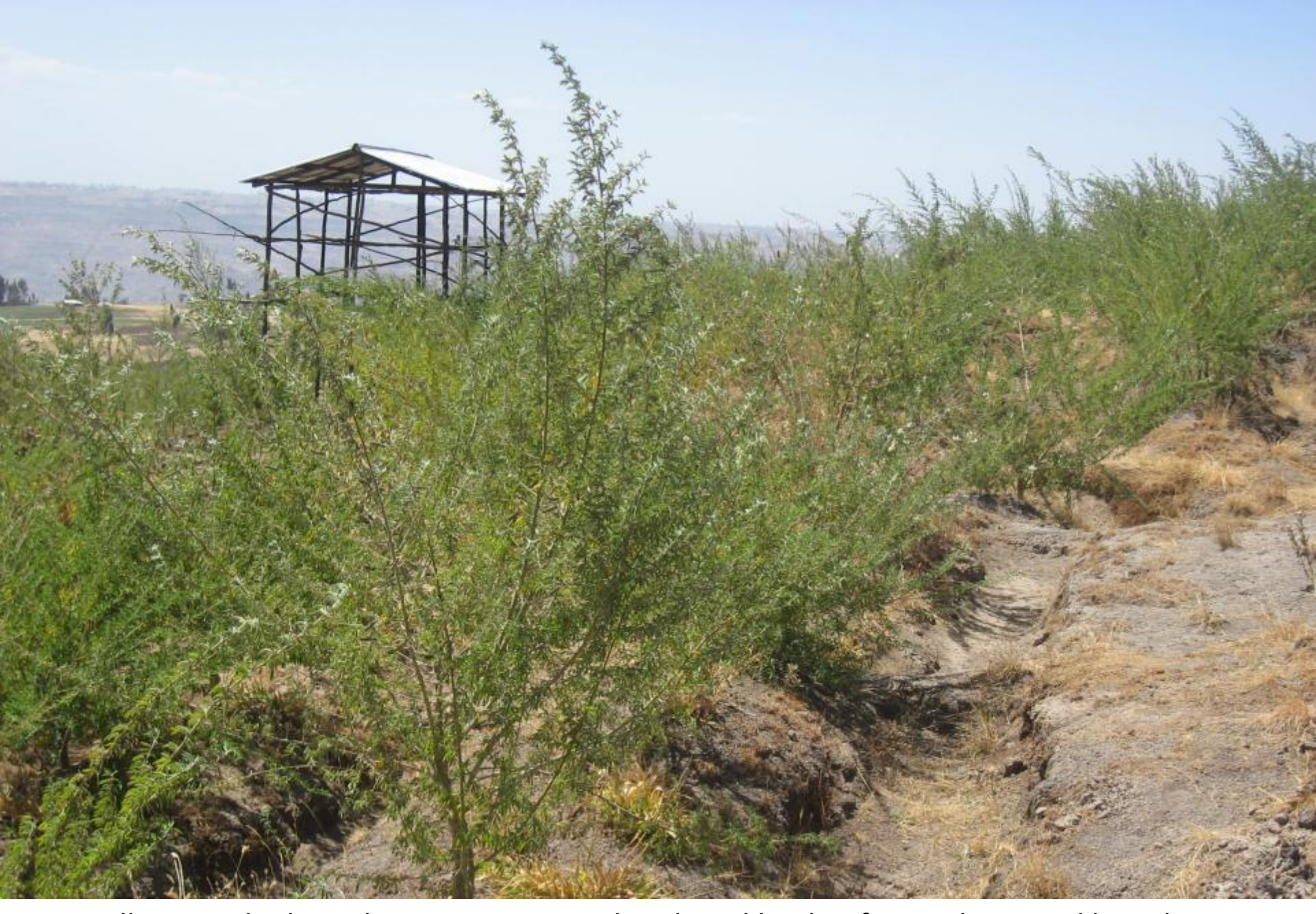
Landless youth planted tree Lucerne on abandoned land to fatten sheep and keep bees; income generation activities in Basona Worena