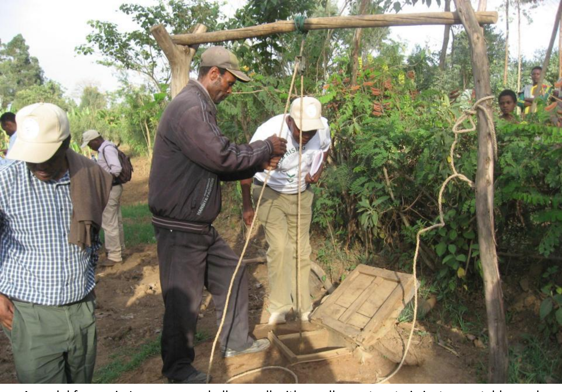
A model farmer in Lemo uses a shallow well with a pulley system to irrigate vegetables and avocado trees