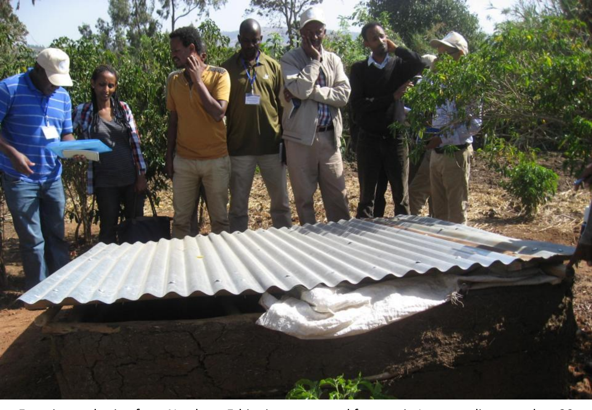
Experience sharing from Northern Ethiopia encouraged farmers in Lemo to dig more than 20 wells for small-scale irrigation