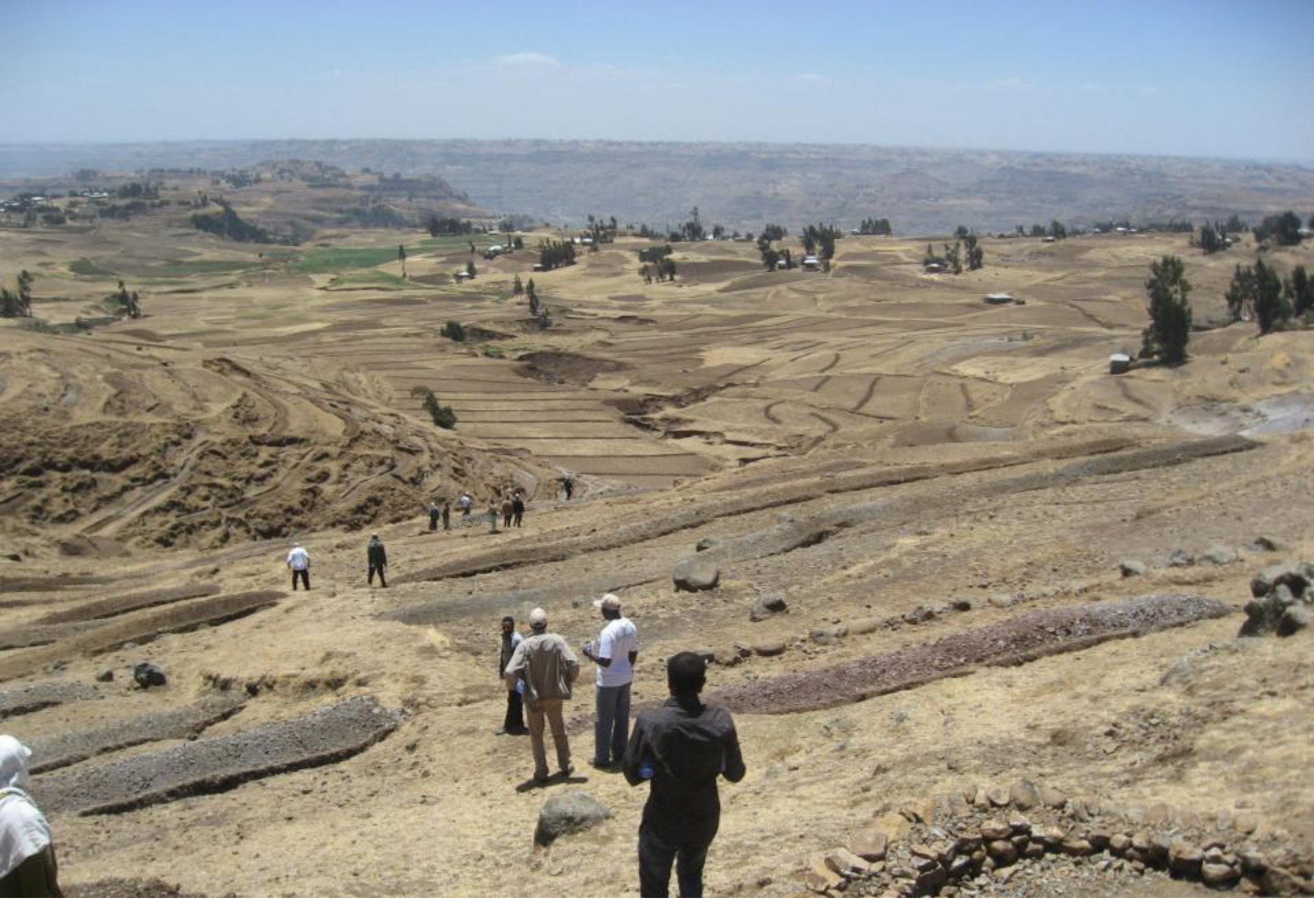
Soil and water conservation and water harvesting structures in Basona Worena