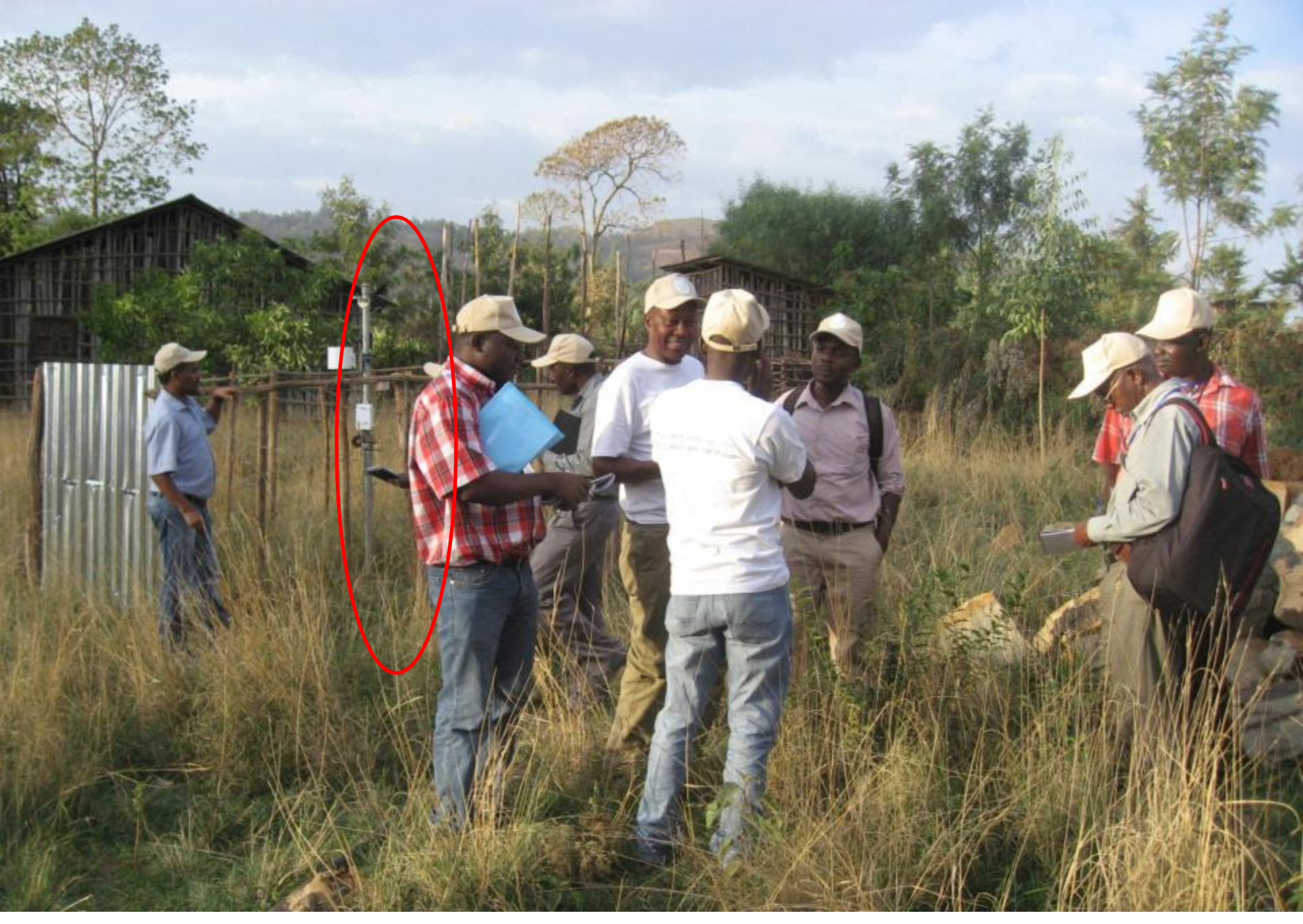
Visiting one of 8 weather stations in Upper Gana kebele (Lemo)