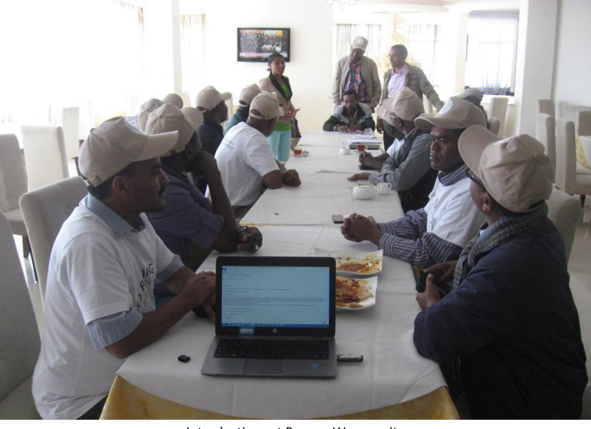
Introductions at Basona Worena site