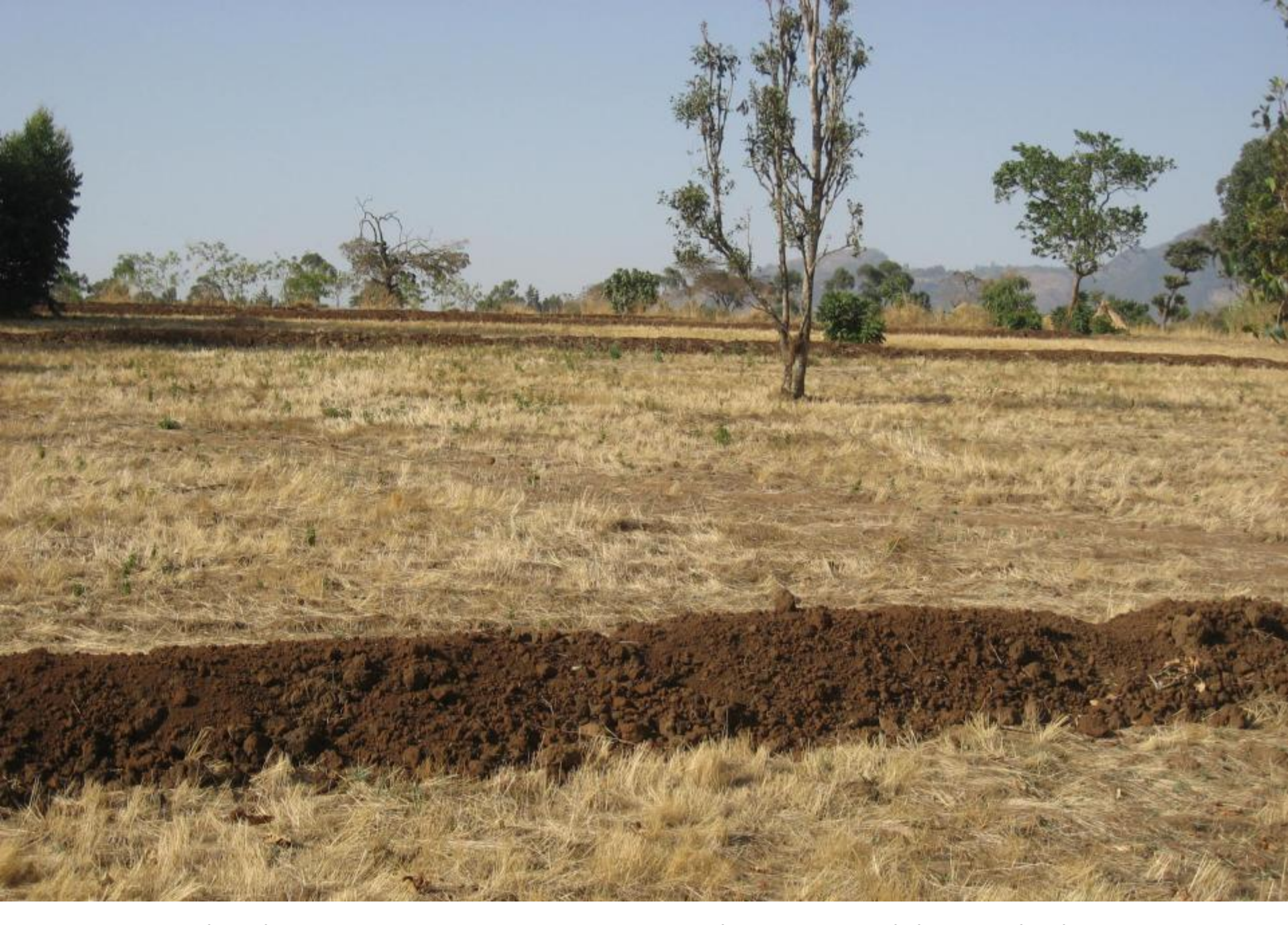
Soil and water conservation structures at the Lemo model watershed site