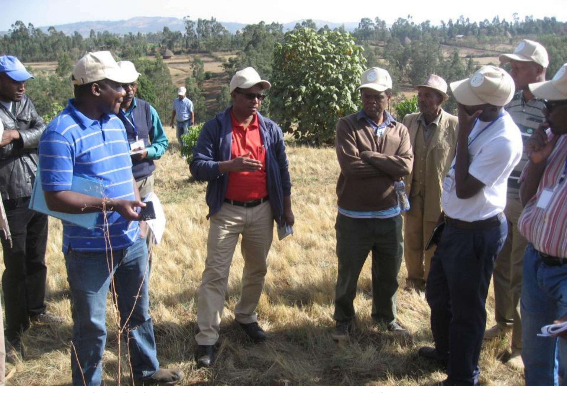
Discussing how the landscape initiative in Lemo encouraged farmers to retain some crop residues for soil health and crop production improvement