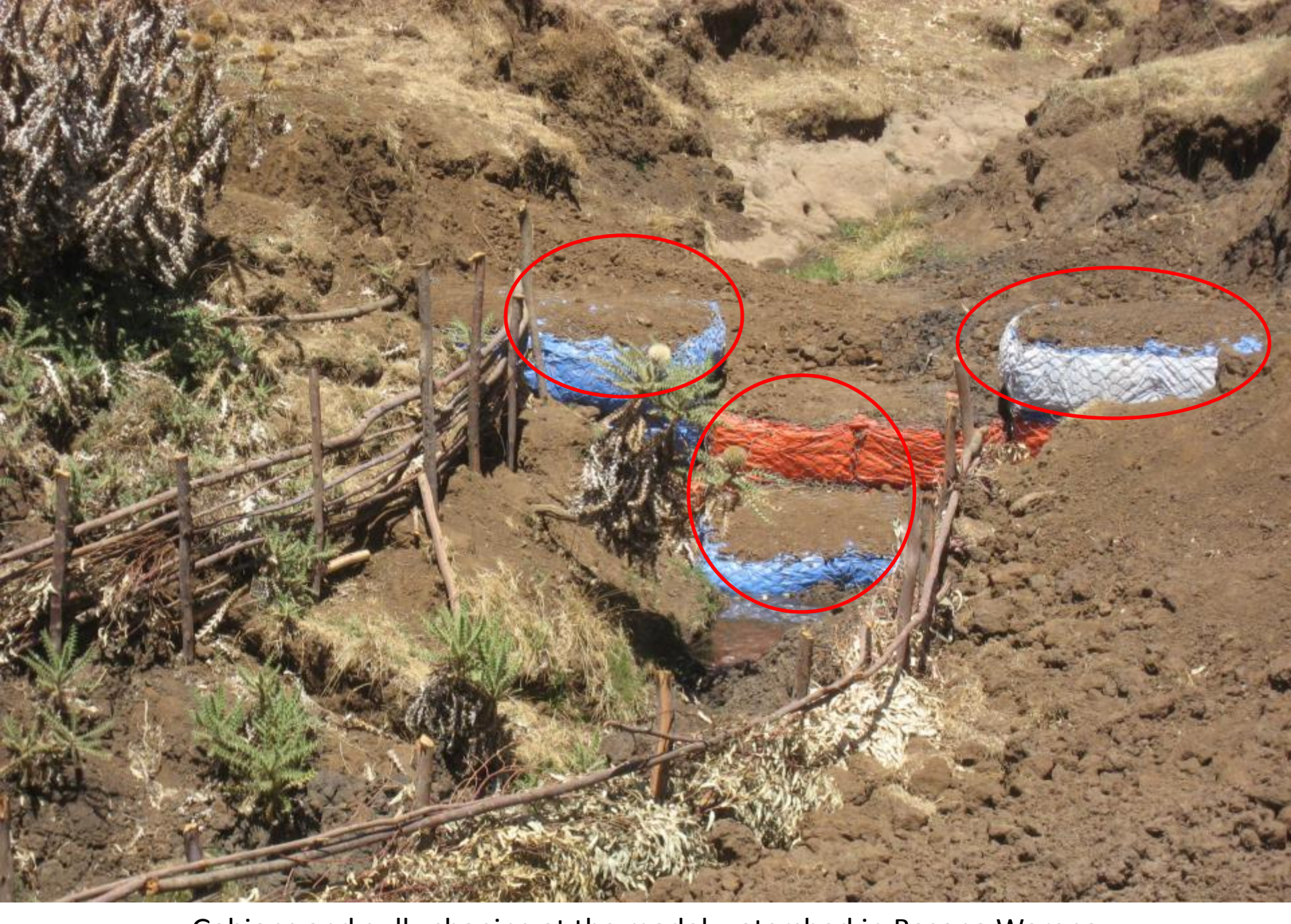
Gabions and gully shaping at the model watershed in Basona Worena