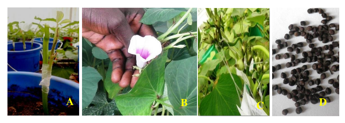
Figure 2. Sweetpotato breeding process. (A) sweetpotato scion grafted on I. setosa root stock; (B) sweetpotato fully bloomed flower (C); seed capsules of sweetpotato produced from the crosses; (D) sweetpotato seed.

and primer F (0.5 \mu I) and primer R (0.5 \mu I) and adjusted to 25 \mu I with nuclease free water. PCR conditions were as follows: initial denaturation of DNA at 93°C for 2 min and then amplified through 35 thermal cycles of 93°C for 15 s, 55°C for 30 s, 72°C for two minutes and ending by a final extension step at 72°C for 7 min. The PCR amplicons were separated by electrophoresis on 1% agrose gel in Tris-EDTA (TE) buffer stained with ethidium bromide and visualized under UV light. The presence or absence of the transgenes in the hybrids was used to confirm the transgenic and non transgenic progeny. The presence or absence of the transgenes in the F1 progeny was used to confirm the segregation in transgenic lines. The segregation data were analysed by the \chi^2 test at P < 0.05 to determine if the observed segregation ratios of cry7Aa1 fit the expected Mendelian 1:1 phenotypic ratio.