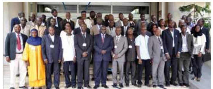
Fig. 1. Meeting of representatives of National C-CASA Platforms in 2012, including Malian researchers and policy makers involved in adopting climate change adaptation policies

The conclusions are based on an interview of 17 key climate change adaptation institutions, collectively selected from members of the National Climate Change Committee in Mali.