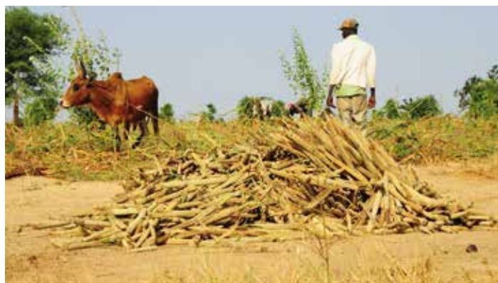
Fig 3. An adaptation strategy - Bouyawere farmers have adopted a millet variety that has a shorter maturity period than Toronion

The opinions of farmers, who are most concerned with climate change, should be taken into account.