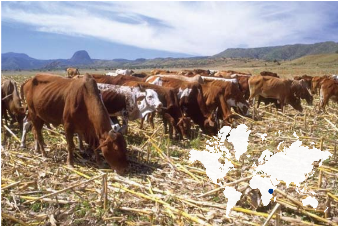
Photo 1: Cattle grazing maize straw in the Ethiopian Highlands. Crops often serve multiple purposes in the agricultural systems of Africa, and maize straw is a key dry-season feed resource for livestock in many places. The impacts of climate change may thus be felt in several different ways in such systems, in addition to its effects on food availability for the farmer's family and cash income for the household.