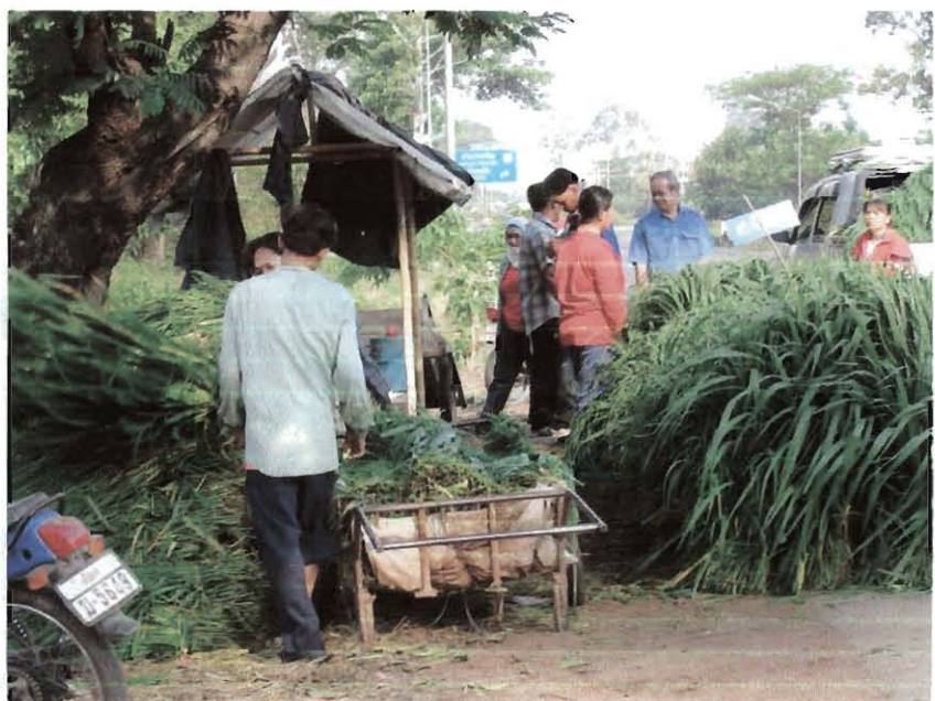
A fresh forage market in Thailand – a new enterprise

Semi-Annual Report – January to June 2005