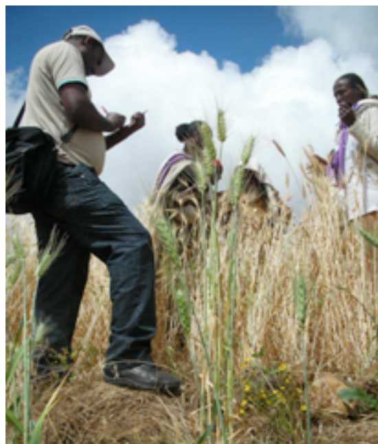
Above: Women participating in trials. In front of them are different varieties of durum wheat and barley seeds.

The Ethiopian Institute of Biodiversity was critical to the testing, selection and distribution of the wheat and barley varieties. Moreover, the women farmers acted both as beneficiaries and partners in the project insofar as they received, tested and distributed the landrace seeds widely in their extensive social networks and introduced them into existing conservation structures, such as the community genebanks, which were operating on two of the three initial sites.