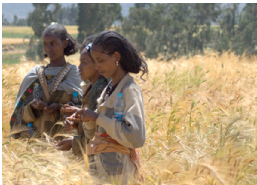
Above: Farmers evaluating durum wheat varieties in the Tigray region, Ethiopia.