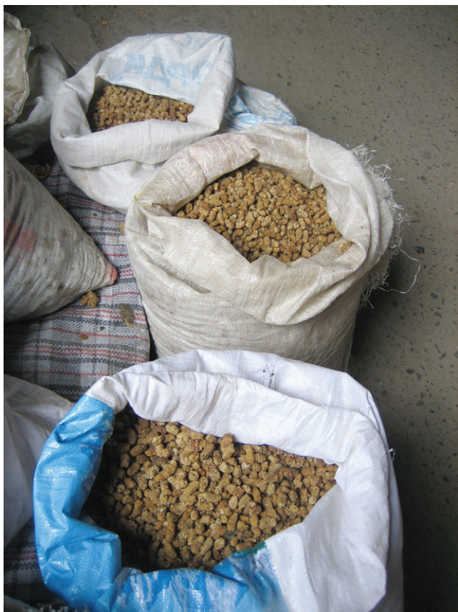
FIGURE 5 Dried mulberry sold on the local market in Khorog.

indigenous people's livelihood security has been based on the consumption of tubers and grains, such as quinoa. Farmers have adapted and selected local varieties of these crops to reduce their vulnerability to a range of environmental risks (Hellin and Higman 2005). Pamiri farmers are astutely aware of the importance of maintaining this crop diversity: particular varieties are cultivated for particular reasons (see Supplemental data , Table S1; http://dx.doi.org/10.1659/MRD-JOURNAL-D-10-00109.S1 ), and knowledge about the nutritional and medicinal qualities of fruit varieties is often detailed.