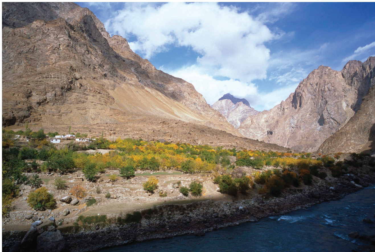
FIGURE 1 The Western Pamiri agricultural landscape: villages are nestled along river beds or on alluvial fans—usually the only flat land found in this region.

and malnutrition, conserving crop diversity is less a choice than a basic necessity for survival. The people of the Pamirs are no exception. Pamiri agriculture is characterized by a great diversity of unique fruit varieties, which have a prominent place in local food culture. A recent study found 33 commonly cultivated varieties of apple, 40 apricot varieties, and 37 mulberry varieties (Bioversity International 2010).