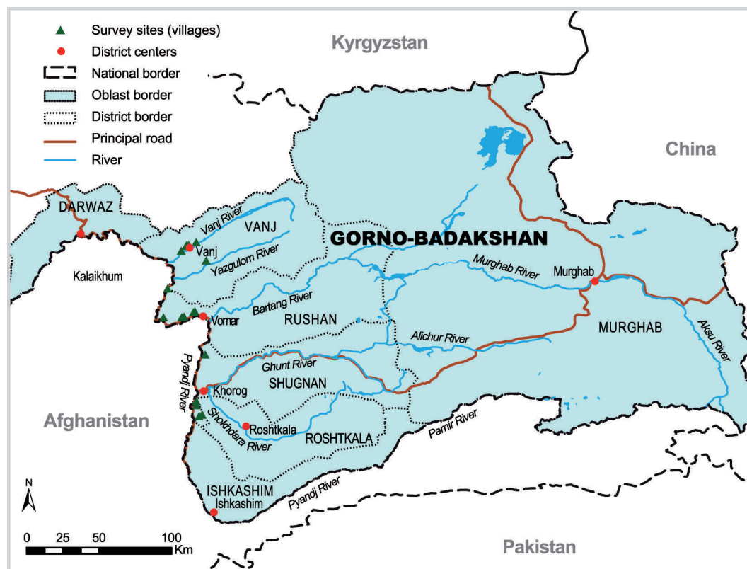
FIGURE 2 The survey area in the Western Tajik Pamirs, GBAO Province. (Map by Frederik van Oudenhoven, adapted from http://www.pamirs.org/trekking.htm )

of researchers of PBI. Households were selected using purpose-sampling. To enhance the representativeness of the sample, families were selected to be of varying socioeconomic levels with different levels of dependence on fruit tree cultivation. A semistructured questionnaire was used to collect information about the reasons for cultivating and maintaining specific varieties (local and introduced), harvesting, processing, marketing, and the income generated from the sale of the particular fruits.