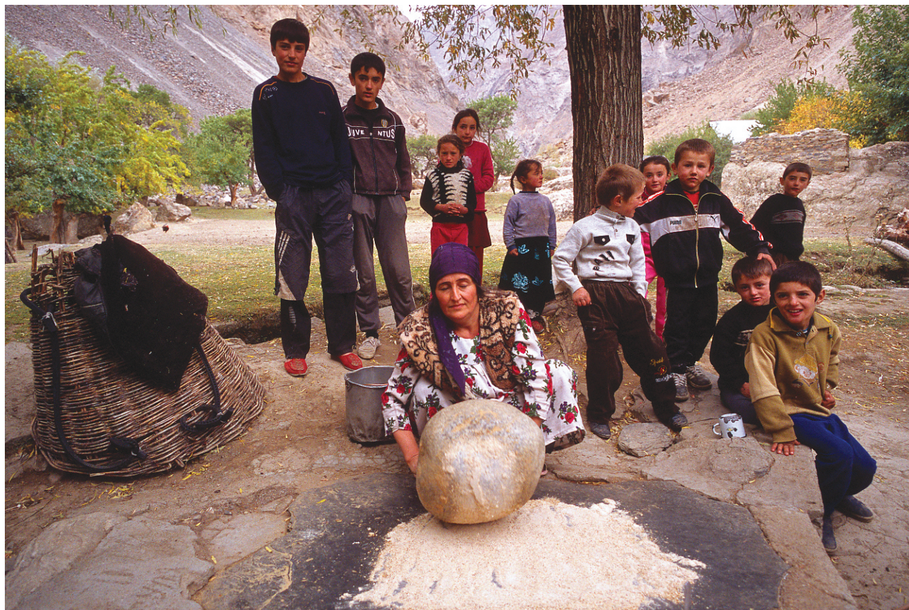
FIGURE 3 A mother in the Yazguliem valley in the western Tajik Pamirs preparing pikht for her children.