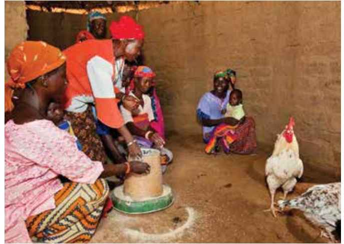
Burkina Faso