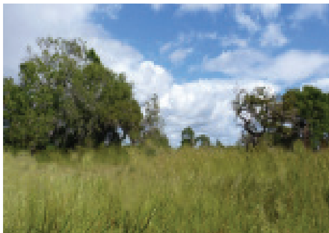
Figure 3. Communal pasture area.

enforced by the relevant district authorities. The project team assisted with the identification and demarcation of the communal pasture areas (Figure 3).