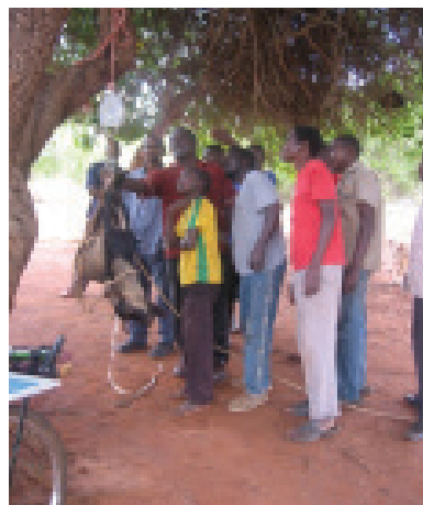
Figure 5. Weighing of goat at a sale.

allowed supplying these markets from June 2013 onwards. In addition, a local private slaughterhouse that recently opened in Vilanculos district may be another important buyer of goats on a regular basis.