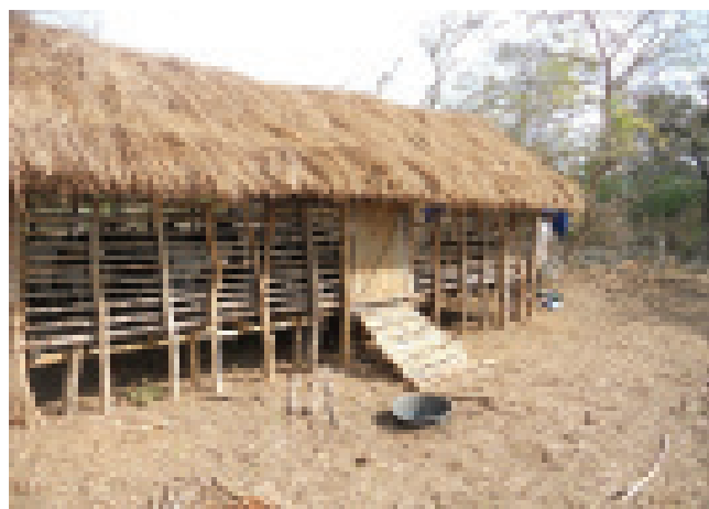
Figure 2. Improved goat shelter from the model farmer in Chimanjane

Apart from improving the health management practices, paravets and goat keepers were also trained in improved reproduction and housing practices. Training manuals were developed for this purpose. In addition, 5 model farmers (of which 2 women) were selected to showcase the improved husbandry practices to their community members. Figure 2 shows an improved goat shelter of one of the model farmers built from local material.