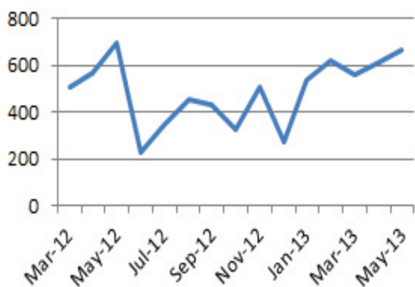
Figure 1: Overview of paid services delivered by paravets per month in Inhassoro district, Inhambane province.

Delivery of animal health services for goats was improved through the ongoing training of 14 community animal health workers (called paravets). The paravets are persons with minimum literacy level, and are goat keepers. They provide basic services such as treatments against internal and external parasites, treatment of wounds etc. They are paid by the goat keepers for the services. Paravets also notify the livestock officer at the District Services for Economic Activities (SDAE) of any animal health issues in the communities bridging the information gap between the goat keepers and existing government structures. Figure 1: Overview of free services delivered by field guides in Jhadol block, Udaipur district.